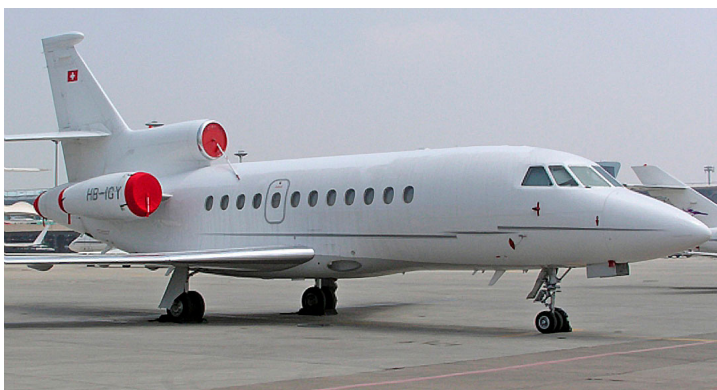
Falcon 900 Engine Covers, hook detail