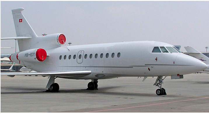
Falcon 900 Engine Covers, hook detail