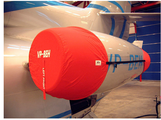
Falcon 900 Engine Covers, outboard & inboard strap detail