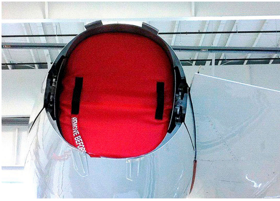
Falcon 2000EX Exhaust Plug