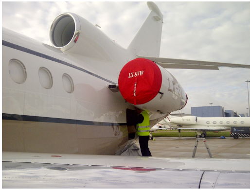
Falcon 900EX Engine Covers