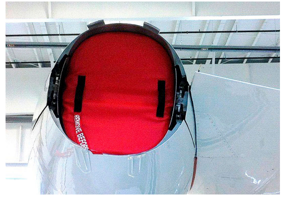
Falcon 2000EX Exhaust Plug