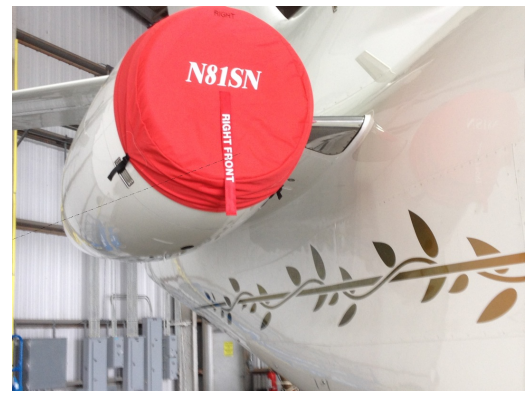
Falcon 900EX Intake Cover