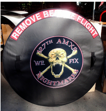
A-10 Engine Intake Plug

The Engine Inlet Plugs are custom fit for your Fairchild A10 Thunderbolt intakes, made with heavy-duty vinyl material, and stuffed with a single block of sculpted urethane foam. Each plug has a zipper that allows the foam to be removed and dried if necessary. Engine plugs have 'remove before flight' streamers sewn onto the face of the plugs. Most plugs are imprinted with the aircraft registration number in black for an extra charge. Storage bag NOT included. Engine plugs may be inserted after flight when the engine is still warm. Engine Inlet Plugs are commonly referred to as Cowl Plugs, Intake Plugs, Cowl Blocks, Engine Blocks, and Engine Bungs.