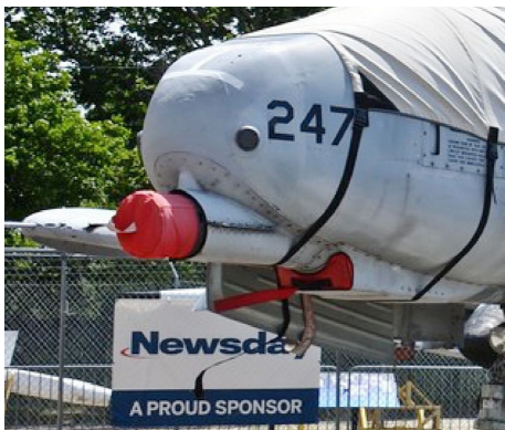
Fairchild A10 Thunderbolt Nose Gun Cover, Gun Scoop Inlet Plug

The Engine Inlet Plugs are custom fit for your Fairchild A10 Thunderbolt intakes, made with heavy-duty vinyl material, and stuffed with a single block of sculpted urethane foam. Each plug has a zipper that allows the foam to be removed and dried if necessary. Engine plugs have 'remove before flight' streamers sewn onto the face of the plugs. Most plugs are imprinted with the aircraft registration number in black for an extra charge. Storage bag NOT included. Engine plugs may be inserted after flight when the engine is still warm. Engine Inlet Plugs are commonly referred to as Cowl Plugs, Intake Plugs, Cowl Blocks, Engine Blocks, and Engine Bungs.