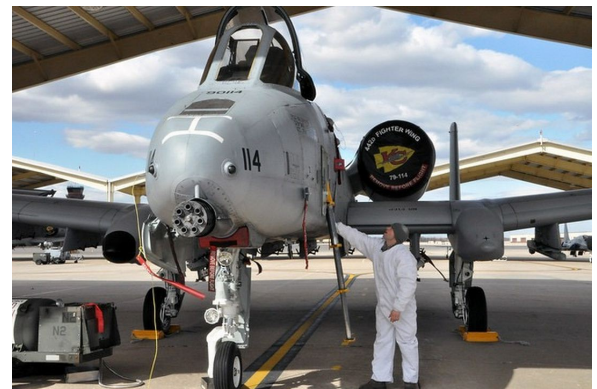
Fairchild A10 Intake Covers &amp; Nose Gun Scoop Plug