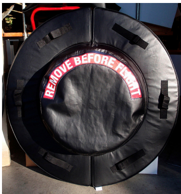
A-10 Exhaust Plug/Cover

The Engine Inlet Plugs are custom fit for your Fairchild A10 Thunderbolt intakes, made with heavy-duty vinyl material, and stuffed with a single block of sculpted urethane foam. Each plug has a zipper that allows the foam to be removed and dried if necessary. Engine plugs have 'remove before flight' streamers sewn onto the face of the plugs. Most plugs are imprinted with the aircraft registration number in black for an extra charge. Storage bag NOT included. Engine plugs may be inserted after flight when the engine is still warm. Engine Inlet Plugs are commonly referred to as Cowl Plugs, Intake Plugs, Cowl Blocks, Engine Blocks, and Engine Bungs.