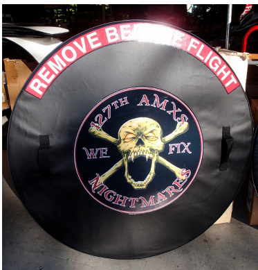
A-10 Engine Intake Plug

The Engine Inlet Plugs are custom fit for your Fairchild A10 Thunderbolt intakes, made with heavy-duty vinyl material, and stuffed with a single block of sculpted urethane foam. Each plug has a zipper that allows the foam to be removed and dried if necessary. Engine plugs have 'remove before flight' streamers sewn onto the face of the plugs. Most plugs are imprinted with the aircraft registration number in black for an extra charge. Storage bag NOT included. Engine plugs may be inserted after flight when the engine is still warm. Engine Inlet Plugs are commonly referred to as Cowl Plugs, Intake Plugs, Cowl Blocks, Engine Blocks, and Engine Bungs.