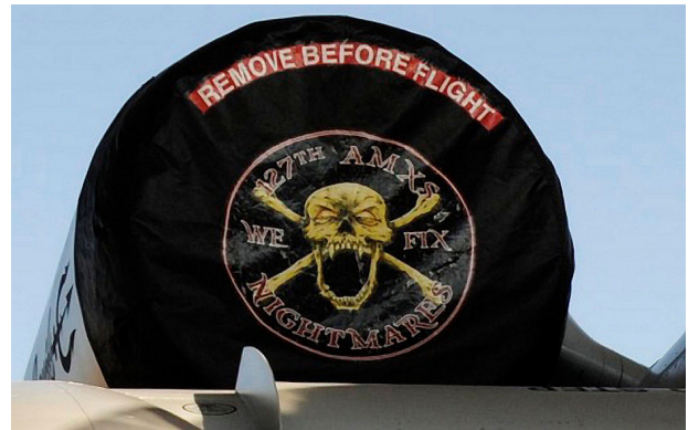
A-10 Engine Covers with Custom Artwork