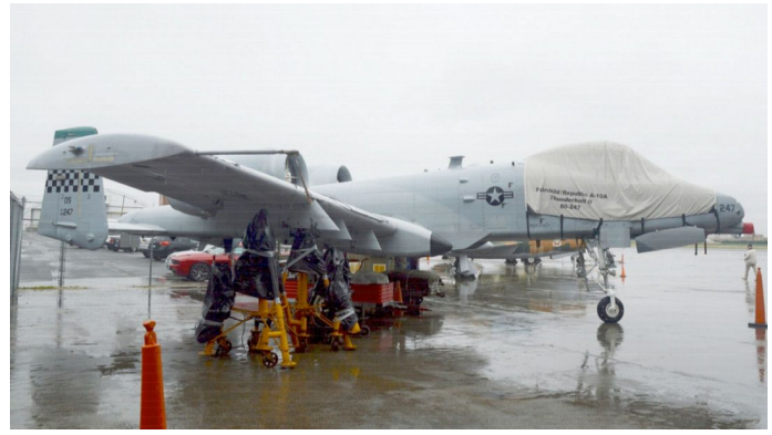
Fairchild A10 Thunderbolt Canopy Cover