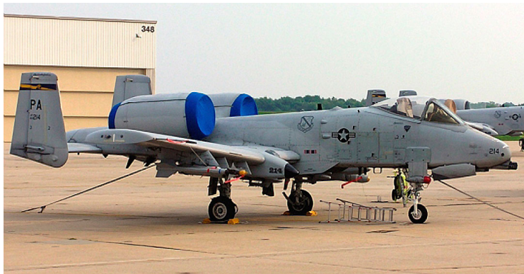
A-10 Engine Covers

ALL-YEAR USE MATERIAL - Made with Solution dyed Polyester fabric, the all-year use material is the best option for sun protection and cover longevity. This heavier more durable material is intended for all weather conditions, such as rain and snow or lots of sun.