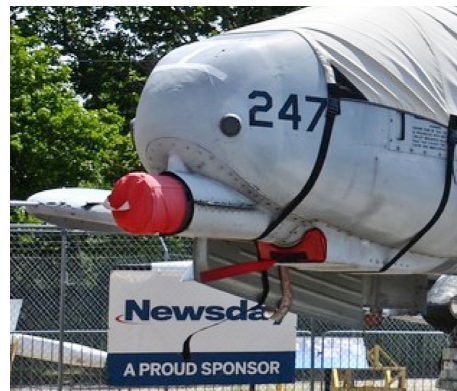
Fairchild A10 Thunderbolt Nose Gun Cover, Gun Scoop Inlet Plug