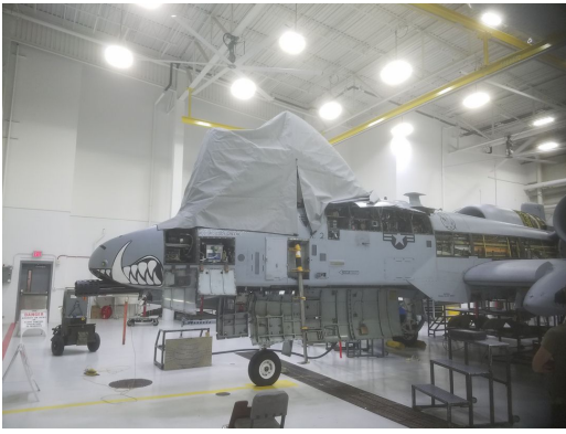
Fairchild A-10 Canopy Cover, open position