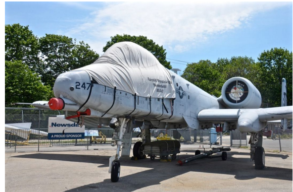
Fairchild A10 Thunderbolt Nose Gun Cover, Gun Scoop Inlet Plug