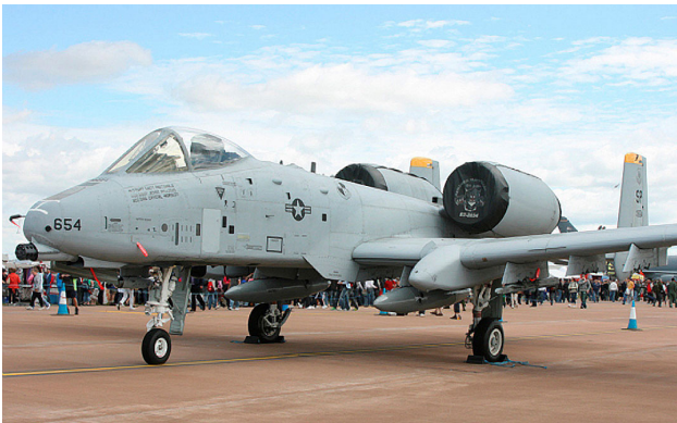
A-10 Engine Covers with Custom Artwork

ALL-YEAR USE MATERIAL - Made with Solution dyed Polyester fabric, the all-year use material is the best option for sun protection and cover longevity. This heavier more durable material is intended for all weather conditions, such as rain and snow or lots of sun.