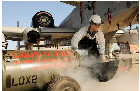
A-10 Engine Intake Cover