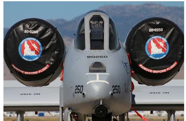
A-10 Engine Covers