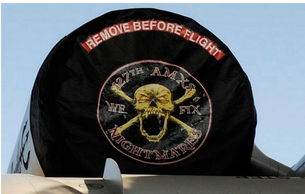
A-10 Engine Covers with Custom Artwork

ALL-YEAR USE MATERIAL - Made with Solution dyed Polyester fabric, the all-year use material is the best option for sun protection and cover longevity. This heavier more durable material is intended for all weather conditions, such as rain and snow or lots of sun.