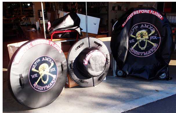
A-10 Engine Intake Plug, Exhaust Plug/Cover, Intake Cover (from left to right)