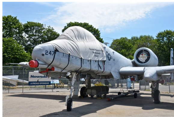
Fairchild A10 Thunderbolt Canopy Cover, Nose Gun Cover, Gun Scoop Inlet Plug