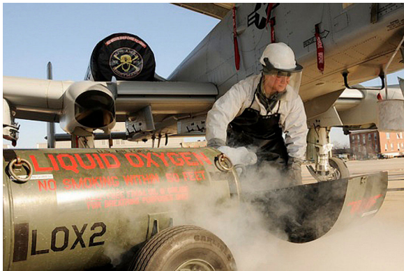
A-10 Engine Intake Cover

ALL-YEAR USE MATERIAL - Made with Solution dyed Polyester fabric, the all-year use material is the best option for sun protection and cover longevity. This heavier more durable material is intended for all weather conditions, such as rain and snow or lots of sun.