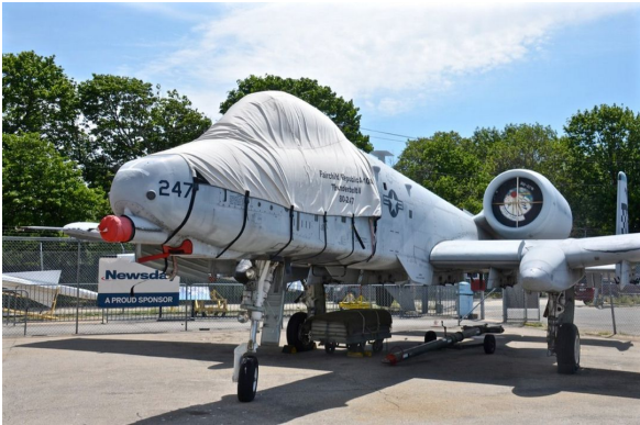
A-10 Engine Intake Plug, Exhaust Plug/Cover, Intake Cover (from left to right) Fairchild A10 Thunderbolt Canopy Cover, Nose Gun Cover, Gun Scoop Inlet Plug