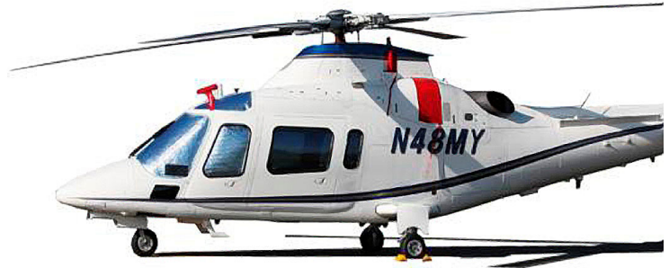
Agusta Power Pitot Covers, Intake Covers, and Cockpit Heatshield set