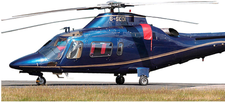
Agusta Power Intake Cover

WINTER USE MATERIAL - Made with Solution-Dyed Polyester fabric, this option is intended for seasonal use to aid in deicing, rain mitigation, or for occasional travel. The material is lighter and more compact, but more susceptible to UV damage and may have a shorter useful life if used continuously outside than the all-year use material.