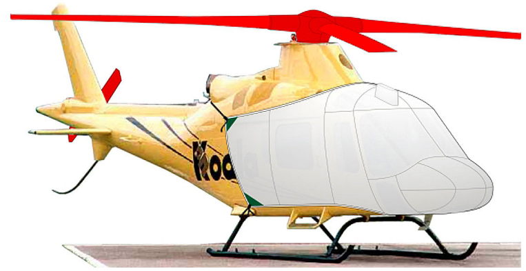
Koala Bubble, Rotor Hub, Blade & Tail Rotor Covers (illustration)