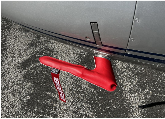
Agusta AW109 (A, C, & Trekker) Pitot Cover Set

pitot cover from melting onto the tube if the pitot heat is accidentally turned on while installed. If you want the set tethered together, please let us know.