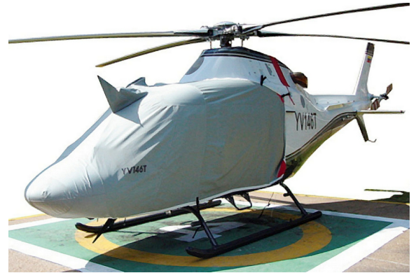
Koala Bubble Cover (with Wire Strike)