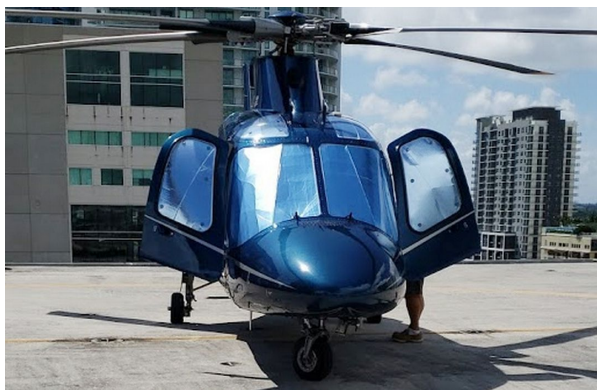
Agusta AW109 Power, A109E Heatshield Set

Cabin Heatshields are interior sunshades for the aircraft's passenger cabin area. The product is a unique composite of closed-cell foam with a silver mylar finish. The semi-rigid design is stiff enough to stand inside the window framing. The set folds up flat and is easily stored in the included storage sleeve. Some designs may require velcro and suction cups. A Heatshield is an excellent short-term remedy for cockpit overheating, but an external fabric cover is more effective for long-term protection.