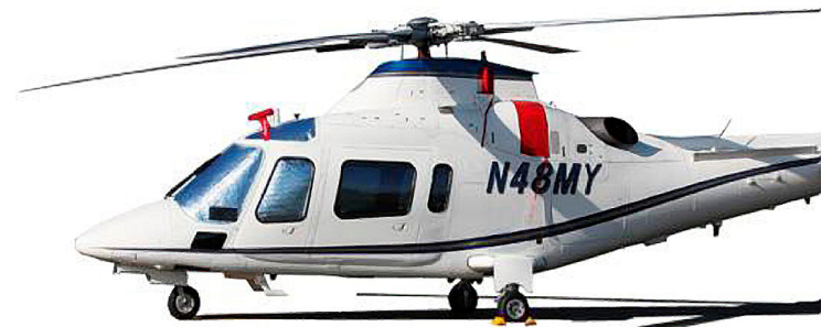
Agusta Power Pitot Covers, Intake Covers, and Cockpit Heatshield set