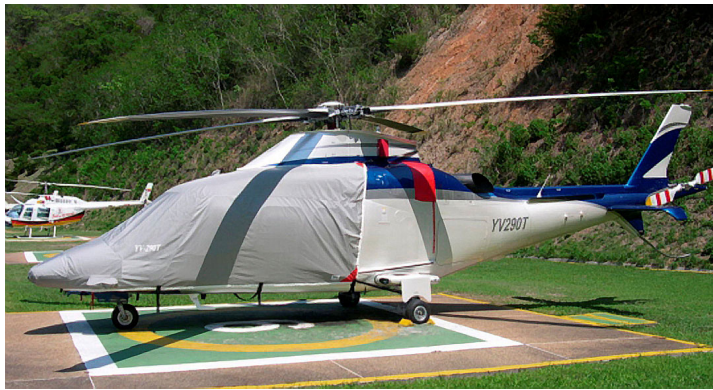
Agusta Grand Bubble Cover

Travel Covers are made with Silver Solution-Dyed Polyester fabric and fully lined over the entire cover. The material is lightweight and more compact for easy storage in the aircraft. The polyester material is water resistant, but only intended for occasional use outside. We also have an ultra lightweight material available for fitted hangar dust covers. For daily outdoor use, the non-travel Sunbrella Cover is the best choice.