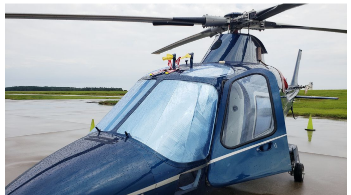
Agusta AW109S/SP Grand Heatshield Set