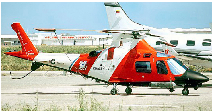
Covers, Plugs, HeatShields and related items for the Agusta MH-68A

Cockpit Heatshields are interior sunshades for the aircraft's cockpit. The product is a unique composite of closed-cell foam with a silver mylar finish. The semi-rigid design is stiff enough to stand inside the window framing. Darts and folds are incorporated into the material so that it conforms to the complex shape of the helicopter windows. The set folds up flat and is easily stored in the included storage sleeve. Some designs may require velcro and suction cups. A Heatshield is an excellent short-term remedy for cockpit overheating, but an external fabric cover is more effective for long-term protection.