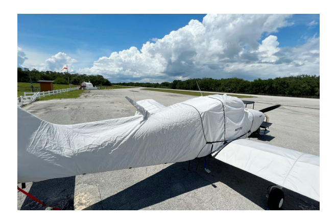
Beech Musketeer A23 Cover Set

This cover type is made from Silver Acrylic Sunbrella canvas and is 100% lined with a soft and smooth microfiber. Bruce's Custom Covers developed this material combination especially for aircraft protection. The outer material is medium weight and treated for water resistance, UV resistance and anti-static buildup. The inner lining is a very soft and smooth microfiber to prevent scratching. The material is very reflective, and tests show that the cabin interior temperature can be reduced to near-ambient temperature on the hottest of days. It is water, ice and snow repellent, yet breathable to allow moisture to escape from between the cover and the aircraft surface.