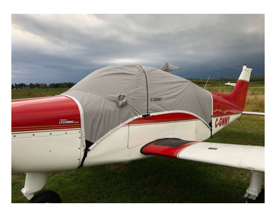
Beech Sundowner Travel Canopy Cover