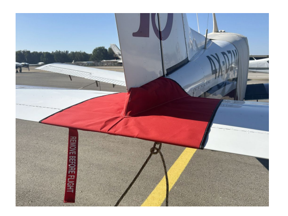
Beech Sierra A24 & C23R Tailcone Cover, Fully Enclosed

WINTER USE MATERIAL - Made with Solution-Dyed Polyester fabric, this option is intended for seasonal use to aid in deicing, rain mitigation, or for occasional travel. The material is lighter and more compact, but more susceptible to UV damage and may have a shorter useful life if used continuously outside than the all-year use material.