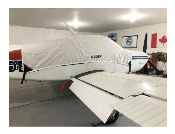
Beech Sierra B24R Canopy Cover