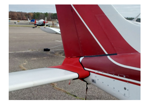
Beech C23 Sundowner Tailcone Cover, fully enclosed