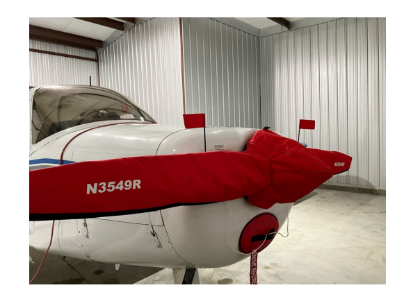
Sport B19 Engine Inlet Plugs