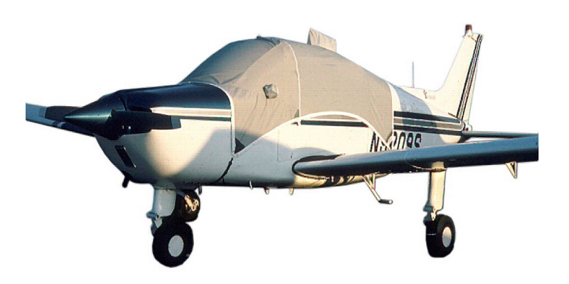
Beech Sport Canopy Cover

Travel Covers are made with Silver Solution-Dyed Polyester fabric and only lined over the windshield to save weight. The material is lightweight and more compact for easy stowage in the aircraft. The polyester material is water resistant, but only intended for occasional use outside. We also have an ultra lightweight material available for fitted hangar dust covers. For daily outdoor use, the non-travel Sunbrella Cover is the best choice.