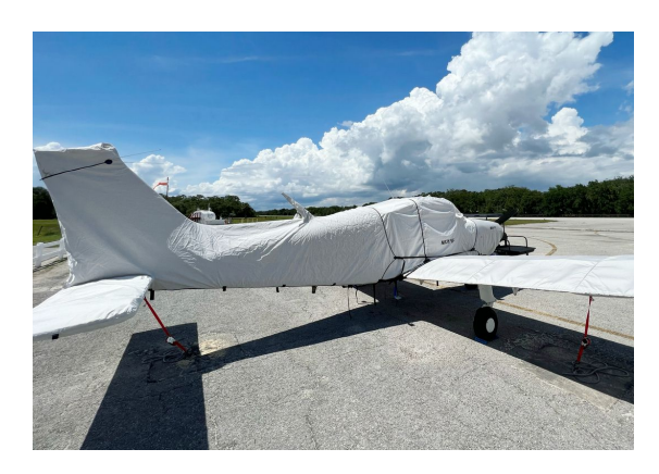
Beech Musketeer A23 Cover Set

This cover type is made from Silver Acrylic Sunbrella canvas and is 100% lined with a soft and smooth microfiber. Bruce's Custom Covers developed this material combination especially for aircraft protection. The outer material is medium weight and treated for water resistance, UV resistance and anti-static buildup. The inner lining is a very soft and smooth microfiber to prevent scratching. The material is very reflective, and tests show that the cabin interior temperature can be reduced to near-ambient temperature on the hottest of days. It is water, ice and snow repellent, yet breathable to allow moisture to escape from between the cover and the aircraft surface.