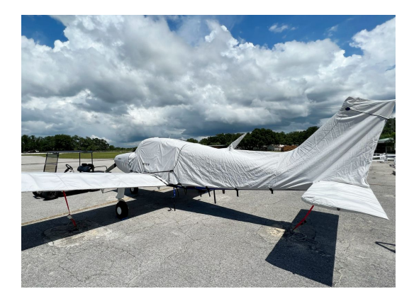
Beech Musketeer A23 Cover Set