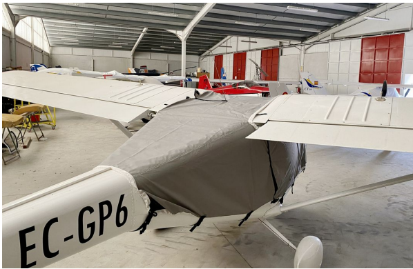
Aeroprakt A22 Over-Top Canopy Cover

Travel Covers are made with Silver Solution-Dyed Polyester fabric and only lined over the windshield to save weight. The material is lightweight and more compact for easy stowage in the aircraft. The polyester material is water resistant, but only intended for occasional use outside. We also have an ultra lightweight material available for fitted hangar dust covers. For daily outdoor use, the non-travel Sunbrella Cover is the best choice.