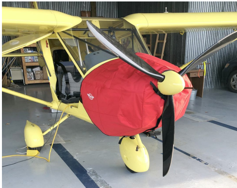
Aeroprakt A-22 Valor Insulated Engine Cover

Insulated Covers Material - A special composite material of solution-dyed polyester, 3M Thinsulate insulation, and soft nylon interior fabric. Our insulated covers are designed to complement an engine preheater and help retain heat in the engine compartment after shutdown. If you operate your aircraft in cold-weather, these covers will help prevent engine wear and tear.