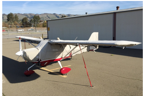
Eurofox Canopy, Engine, Wings and Empennage Covers