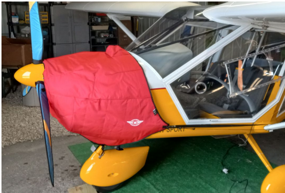
Aeroprakt A-22 Insulated Engine Cover