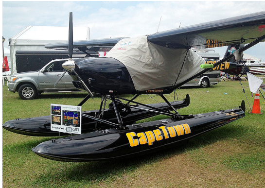
A-22 Over-the-Top Canopy Cover

This cover type is made from Silver Acrylic Sunbrella canvas and is 100% lined with a soft and smooth microfiber. Bruce's Custom Covers developed this material combination especially for aircraft protection. The outer material is medium weight and treated for water resistance, UV resistance and anti-static buildup. The inner lining is a very soft and smooth microfiber to prevent scratching. The material is very reflective, and tests show that the cabin interior temperature can be reduced to near-ambient temperature on the hottest of days. It is water, ice and snow repellent, yet breathable to allow moisture to escape from between the cover and the aircraft surface.