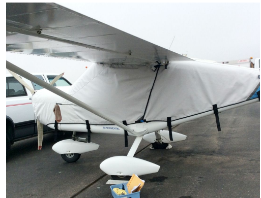
Aeroprakt A-22 Valor Canopy/Engine Cover