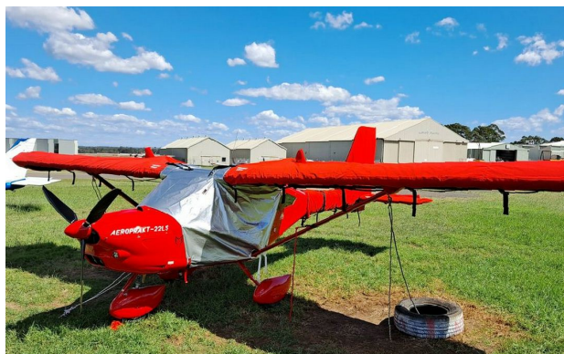
Aeroprakt A22 Wing & Empennage Covers

WINTER USE MATERIAL - Made with Solution-Dyed Polyester fabric, this option is intended for seasonal use to aid in deicing, rain mitigation, or for occasional travel. The material is lighter and more compact, but more susceptible to UV damage and may have a shorter useful life if used continuously outside than the all-year use material.