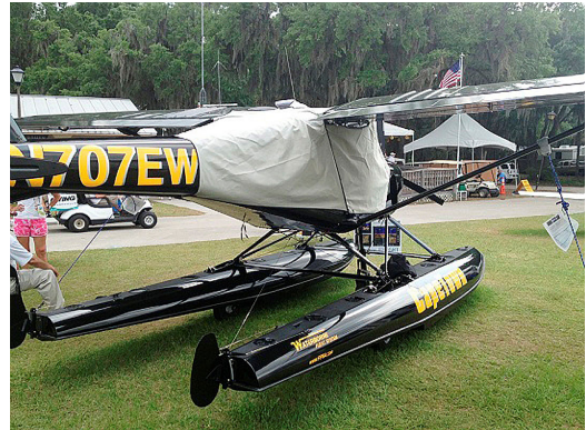
A-22 Over-the-Top Canopy Cover