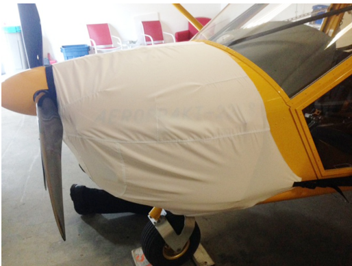
A-22 Engine Cover, test fit

Insulated Covers Material - A special composite material of solution-dyed polyester, 3M Thinsulate insulation, and soft nylon interior fabric. Our insulated covers are designed to complement an engine preheater and help retain heat in the engine compartment after shutdown. If you operate your aircraft in cold-weather, these covers will help prevent engine wear and tear.