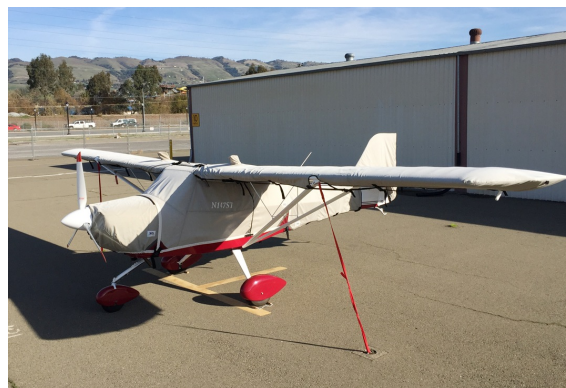
Eurofox Canopy, Engine, Wings and Empennage Covers