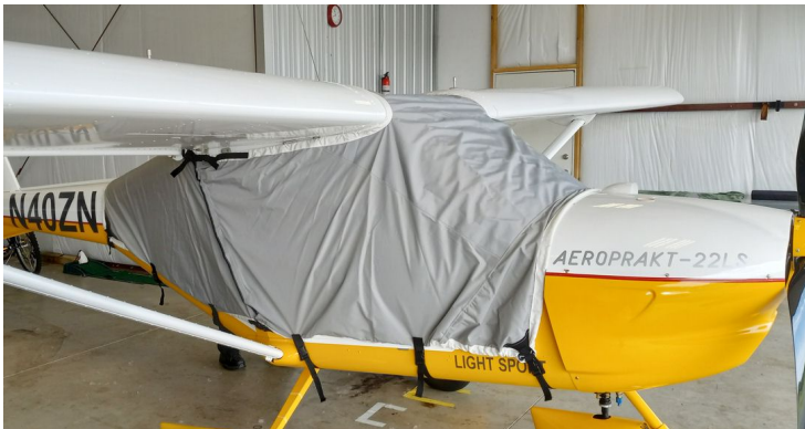
Aeroprakt A-22 Travel Weight Canopy Cover