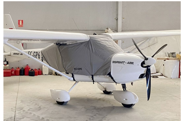
Aeroprakt A22 Over-Top Canopy Cover