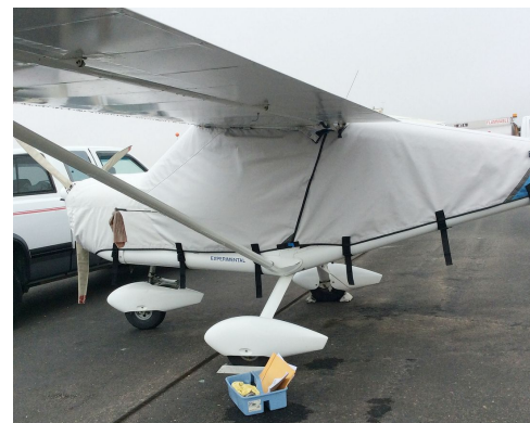
Aeroprakt A-22 Valor Capetown, Foxbat Canopy/Engine Cover