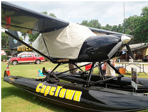
A-22 Over-the-Top Canopy Cover

Travel Covers are made with Silver Solution-Dyed Polyester fabric and only lined over the windshield to save weight. The material is lightweight and more compact for easy stowage in the aircraft. The polyester material is water resistant, but only intended for occasional use outside. We also have an ultra lightweight material available for fitted hangar dust covers. For daily outdoor use, the non-travel Sunbrella Cover is the best choice.