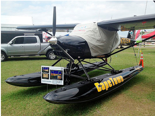
A-22 Over-the-Top Canopy Cover

This cover type is made from Silver Acrylic Sunbrella canvas and is 100% lined with a soft and smooth microfiber. Bruce's Custom Covers developed this material combination especially for aircraft protection. The outer material is medium weight and treated for water resistance, UV resistance and anti-static buildup. The inner lining is a very soft and smooth microfiber to prevent scratching. The material is very reflective, and tests show that the cabin interior temperature can be reduced to near-ambient temperature on the hottest of days. It is water, ice and snow repellent, yet breathable to allow moisture to escape from between the cover and the aircraft surface.