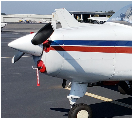
Beech Musketeer Engine Inlet Plugs

Engine Inlet Plugs are custom fit for your Beech Musketeer A23 intakes, made with heavy-duty vinyl material, and stuffed with a single block of sculpted urethane foam. Each plug has a zipper that allows the foam to be removed and dried if necessary. Engine plugs have warning flags that are visible from the cockpit or 'remove before flight' streamers sewn onto the face of the plugs. Most plugs are imprinted with the aircraft registration number in black for an extra charge. Storage bag NOT included. Engine plugs may be inserted after flight when the engine is still warm. Engine Inlet Plugs are commonly referred to as Cowl Plugs, Intake Plugs, Cowl Blocks, Engine Blocks, and Engine Bungs.