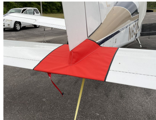
Beech C23 Tailcone Cover, Fully Enclosed