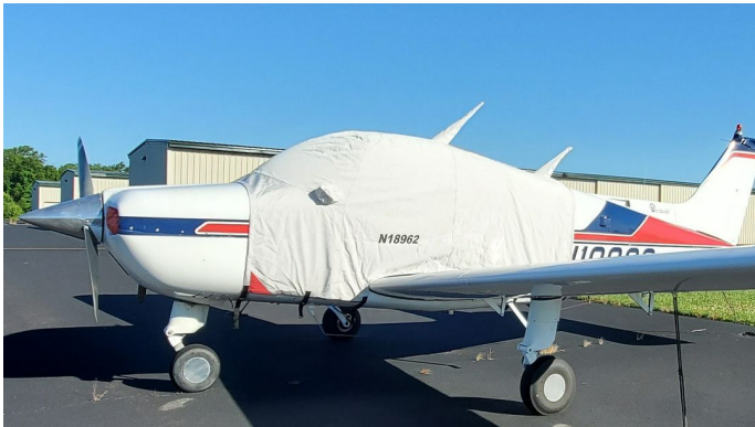
Beech C23 Sundowner Extended Canopy Cover

This cover type is made from Silver Acrylic Sunbrella canvas and is 100% lined with a soft and smooth microfiber. Bruce's Custom Covers developed this material combination especially for aircraft protection. The outer material is medium weight and treated for water resistance, UV resistance and anti-static buildup. The inner lining is a very soft and smooth microfiber to prevent scratching. The material is very reflective, and tests show that the cabin interior temperature can be reduced to near-ambient temperature on the hottest of days. It is water, ice and snow repellent, yet breathable to allow moisture to escape from between the cover and the aircraft surface.