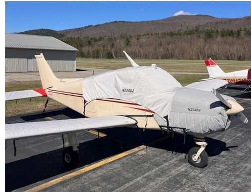
Beech A23 Musketeer Canopy, Insulated Engine, Wing Covers