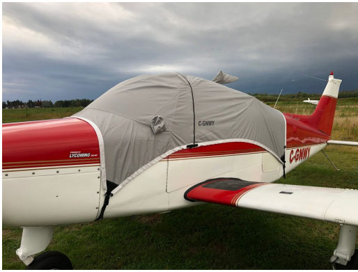
Beech Sundowner Travel Canopy Cover