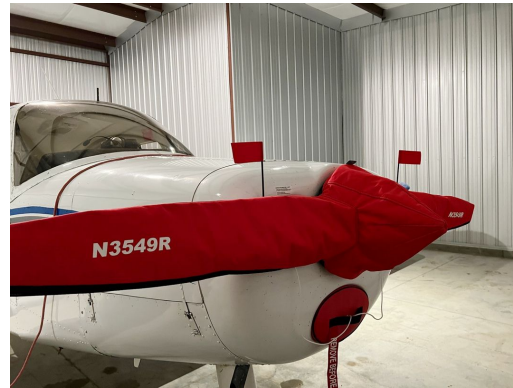
Beech A23 Musketeer Insulated Prop Cover, Engine Plugs