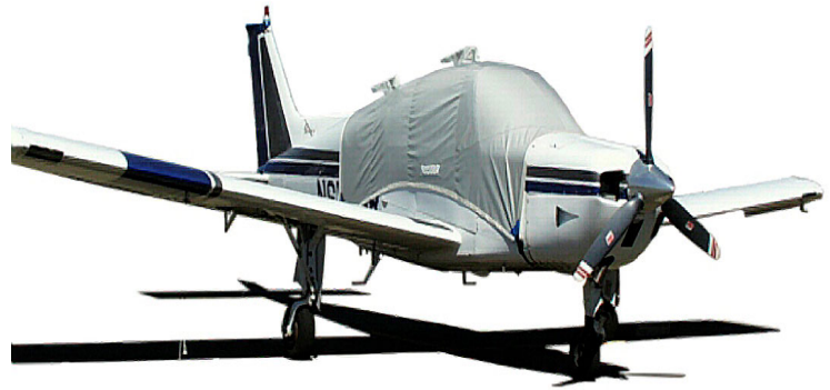
Beech Sport Canopy Cover