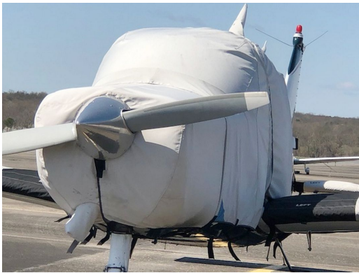
Beech Sundowner Engine Cover

This cover type is made from Silver Acrylic Sunbrella canvas and is 100% lined with a soft and smooth microfiber. Bruce's Custom Covers developed this material combination especially for aircraft protection. The outer material is medium weight and treated for water resistance, UV resistance and anti-static buildup. The inner lining is a very soft and smooth microfiber to prevent scratching. The material is very reflective, and tests show that the cabin interior temperature can be reduced to near-ambient temperature on the hottest of days. It is water, ice and snow repellent, yet breathable to allow moisture to escape from between the cover and the aircraft surface.