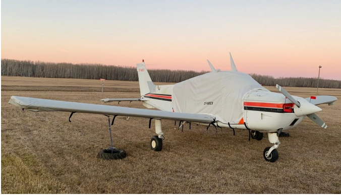
Sport B19 Engine Inlet Plugs

This cover type is made from Silver Acrylic Sunbrella canvas and is 100% lined with a soft and smooth microfiber. Bruce's Custom Covers developed this material combination especially for aircraft protection. The outer material is medium weight and treated for water resistance, UV resistance and anti-static buildup. The inner lining is a very soft and smooth microfiber to prevent scratching. The material is very reflective, and tests show that the cabin interior temperature can be reduced to near-ambient temperature on the hottest of days. It is water, ice and snow repellent, yet breathable to allow moisture to escape from between the cover and the aircraft surface.