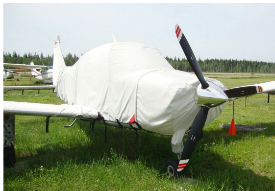
Beech Sierra Engine, Extended Canopy, Empennage, & Wing Covers