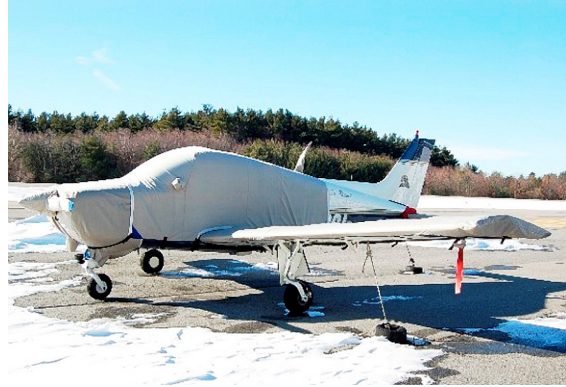
Prop, Engine, Extended Canopy, Wing, Tailcone, and Horizontal Stab Covers