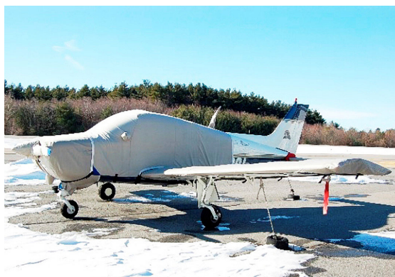
Prop, Engine, Extended Canopy, Wing, Tailcone, and Horizontal Stab Covers