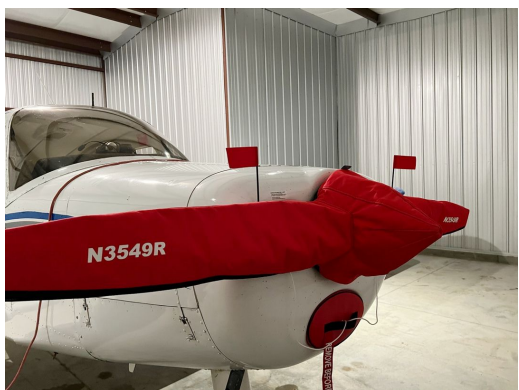
Beech A23 Musketeer Insulated Prop Cover, Engine Plugs

This cover type is made from Silver Acrylic Sunbrella canvas and is 100% lined with a soft and smooth microfiber. Bruce's Custom Covers developed this material combination especially for aircraft protection. The outer material is medium weight and treated for water resistance, UV resistance and anti-static buildup. The inner lining is a very soft and smooth microfiber to prevent scratching. The material is very reflective, and tests show that the cabin interior temperature can be reduced to near-ambient temperature on the hottest of days. It is water, ice and snow repellent, yet breathable to allow moisture to escape from between the cover and the aircraft surface.