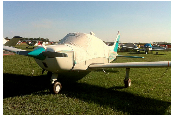
Beech C23 Sundowner Canopy Cover