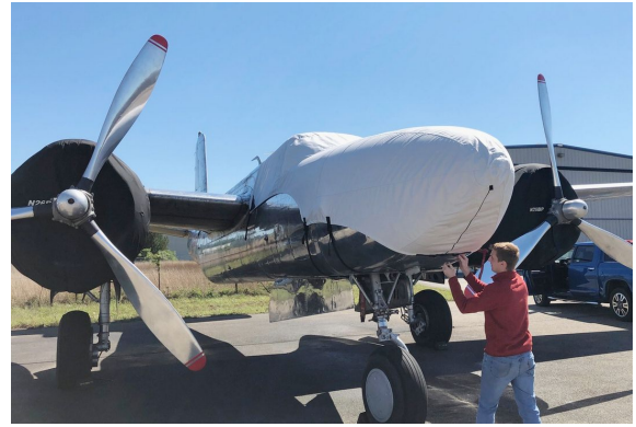
Douglas A26 Invader Cockpit/Nose Cover