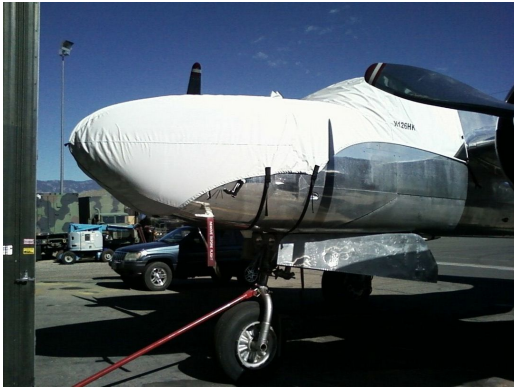
Douglas A26 Invader Cockpit/Nose Cover

the hottest of days. It is water, ice and snow repellent, yet breathable to allow moisture to escape from between the cover and the aircraft surface.