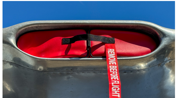
Douglas A26 Invader Oil Cooler Inlet Plugs