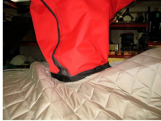
Alouette III Rotor Hub Cover & Engine/Transmission Cover