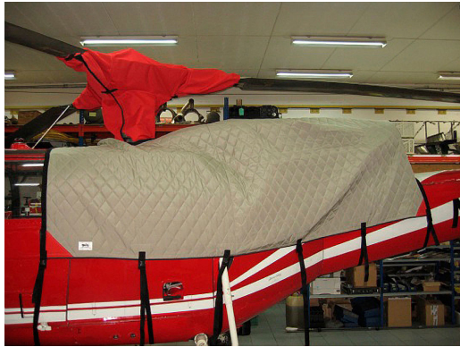
Alouette III Rotor Hub Cover, Insulated Engine/Transmission Cover

WINTER USE MATERIAL - Made with Solution-Dyed Polyester fabric, this option is intended for seasonal use to aid in deicing, rain mitigation, or for occasional travel. The material is lighter and more compact, but more susceptible to UV damage and may have a shorter useful life if used continuously outside than the all-year use material.