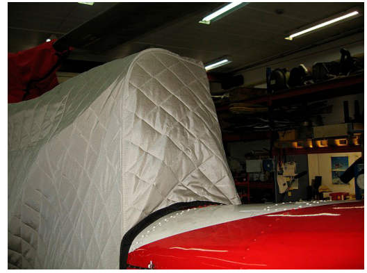
Alouette III Insulated Engine/Transmission Cover