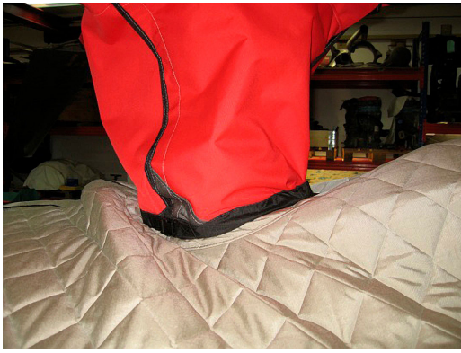
Alouette III Rotor Hub Cover & Engine/Transmission Cover