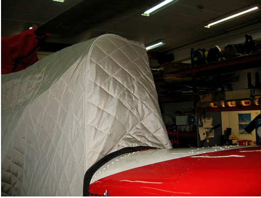
Alouette III Insulated Engine/Transmission Cover

WINTER USE MATERIAL - Made with Solution-Dyed Polyester fabric, this option is intended for seasonal use to aid in deicing, rain mitigation, or for occasional travel. The material is lighter and more compact, but more susceptible to UV damage and may have a shorter useful life if used continuously outside than the all-year use material.