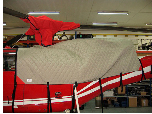
Alouette III Rotor Hub Cover, Insulated Engine/Transmission Cover