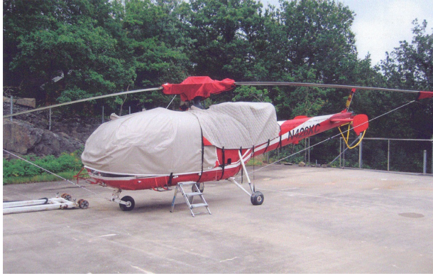
Alouette III Bubble, Rotor Hub & Engine Covers, Blade Tie-Downs

WINTER USE MATERIAL - Made with Solution-Dyed Polyester fabric, this option is intended for seasonal use to aid in deicing, rain mitigation, or for occasional travel. The material is lighter and more compact, but more susceptible to UV damage and may have a shorter useful life if used continuously outside than the all-year use material.