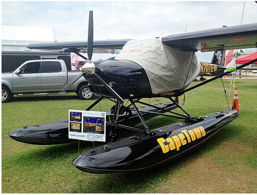
A-22 Over-the-Top Canopy Cover

occasional use outside. We also have an ultra lightweight material available for fitted hangar dust covers. For daily outdoor use, the non-travel Sunbrella Cover is the best choice.