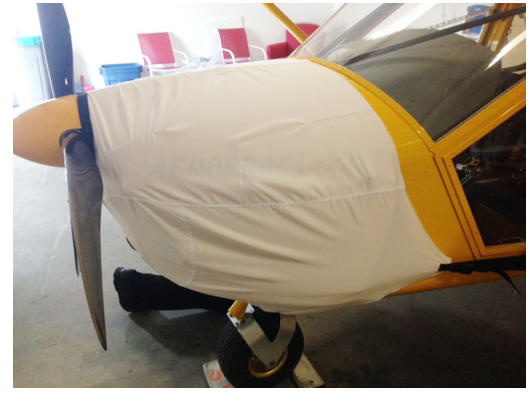
A-22 Engine Cover, test fit