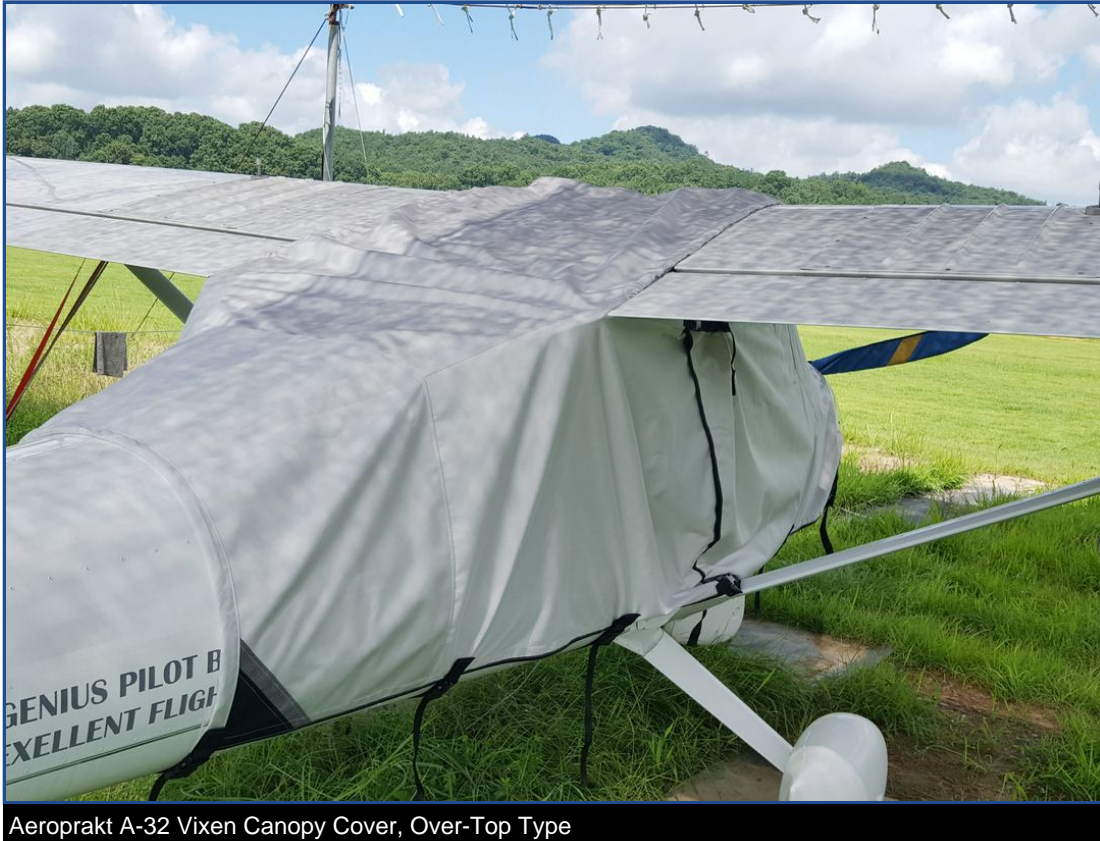
Aeroprakt A-32 Vixxen Canopy Cover, Over-Top Type