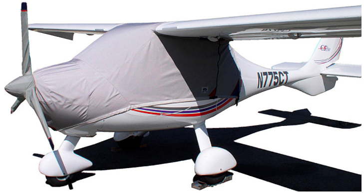
Flight Design CT Canopy/Engine Cover