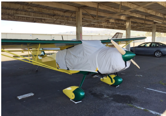
Kitfox Canopy & Engine Covers

shorter useful life if used continuously outside than the all-year use material.