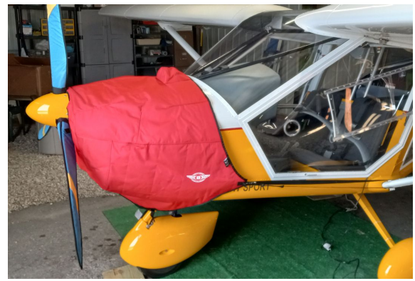
Aeroprakt A-22 Insulated Engine Cover