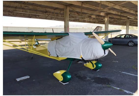
Kitfox Canopy & Engine Covers