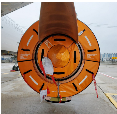
Airbus A320 Exhaust & Bypass Vent Plugs

The Engine Inlet Plugs are custom fit for your Airbus A320 intakes, made with heavy-duty vinyl material, and stuffed with a single block of sculpted urethane foam. Each plug has a zipper that allows the foam to be removed and dried if necessary. Engine plugs have 'remove before flight' streamers sewn onto the face of the plugs. Most plugs are imprinted with the aircraft registration number in black for an extra charge. Storage bag NOT included. Engine plugs may be inserted after flight when the engine is still warm. Engine Inlet Plugs are commonly referred to as Cowl Plugs, Intake Plugs, Cowl Blocks, Engine Blocks, and Engine Bungs.