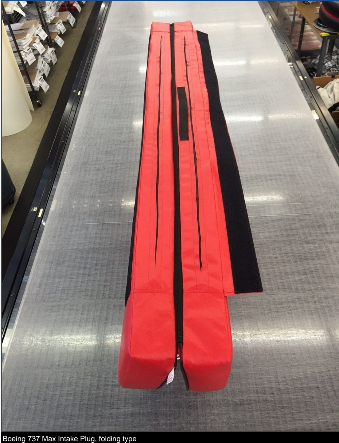
Boeing 737 Max Intake Plug, folding type