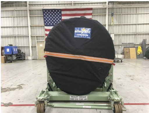
CFM56-5B Off Link Cover, fully enclosed

ALL-YEAR USE MATERIAL - Made with Solution dyed Polyester fabric, the all-year use material is the best option for sun protection and cover longevity. This heavier more durable material is intended for all weather conditions, such as rain and snow or lots of sun.