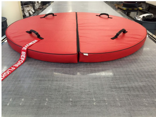
Boeing 737 Max Intake Plug, folding type

The Engine Inlet Plugs are custom fit for your Airbus A320 intakes, made with heavy-duty vinyl material, and stuffed with a single block of sculpted urethane foam. Each plug has a zipper that allows the foam to be removed and dried if necessary. Engine plugs have 'remove before flight' streamers sewn onto the face of the plugs. Most plugs are imprinted with the aircraft registration number in black for an extra charge. Storage bag NOT included. Engine plugs may be inserted after flight when the engine is still warm. Engine Inlet Plugs are commonly referred to as Cowl Plugs, Intake Plugs, Cowl Blocks, Engine Blocks, and Engine Bungs.