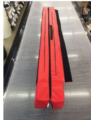
Boeing 737 Max Intake Plug, folding type