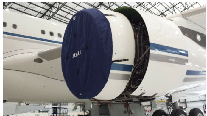
Airbus 340 Intake Covers