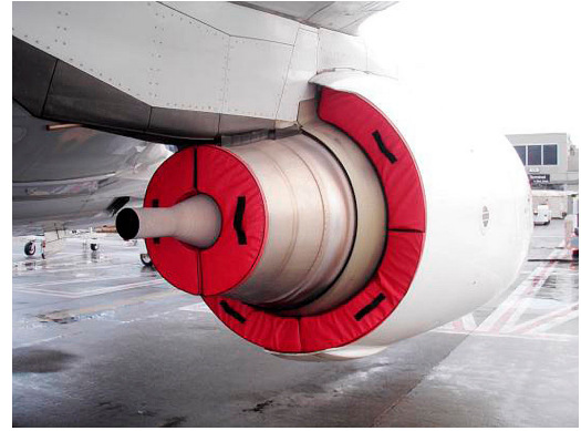
Boeing 737 Bypass and Exhaust Plugs