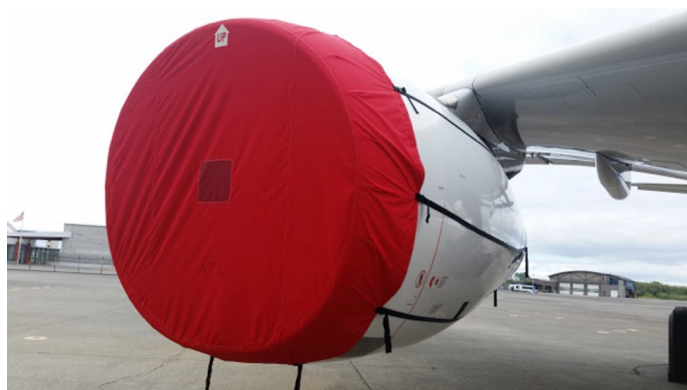
Airbus A330 Intake Cover, Trent 700 Engine