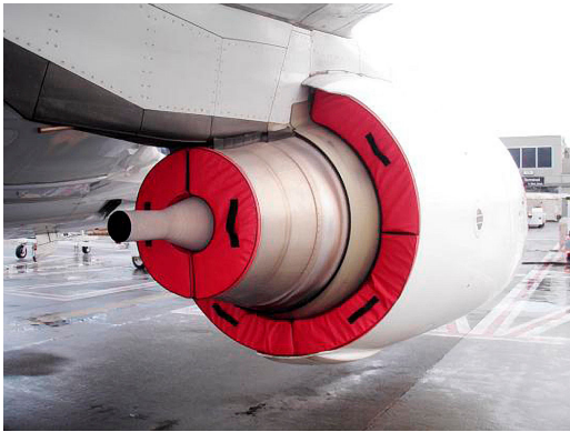
Boeing 737 Bypass and Exhaust Plugs

The Engine Exhaust Plugs are custom fit for your Airbus A330, A350 exhaust openings, made with heavy-duty vinyl material, and stuffed with a single block of sculpted urethane foam. Each plug has a zipper that allows the foam to be removed and dried if necessary. Exhaust plugs have 'remove before flight' streamers sewn onto the face of the plugs. Most plugs are imprinted with the aircraft registration number in black for an extra charge. Exhaust plugs may be inserted soon after flight when the engine is still warm. Engine Inlet Plugs are commonly referred to as Cowl Plugs, Intake Plugs, Cowl Blocks, Engine Blocks, and Engine Bungs.