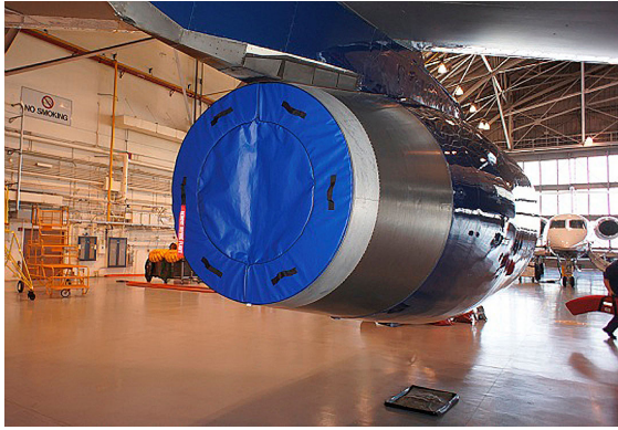
Boeing 757 Exhaust Plugs

The Engine Exhaust Plugs are custom fit for your Airbus A330, A350 exhaust openings, made with heavy-duty vinyl material, and stuffed with a single block of sculpted urethane foam. Each plug has a zipper that allows the foam to be removed and dried if necessary. Exhaust plugs have 'remove before flight' streamers sewn onto the face of the plugs. Most plugs are imprinted with the aircraft registration number in black for an extra charge. Exhaust plugs may be inserted soon after flight when the engine is still warm. Engine Inlet Plugs are commonly referred to as Cowl Plugs, Intake Plugs, Cowl Blocks, Engine Blocks, and Engine Bungs.