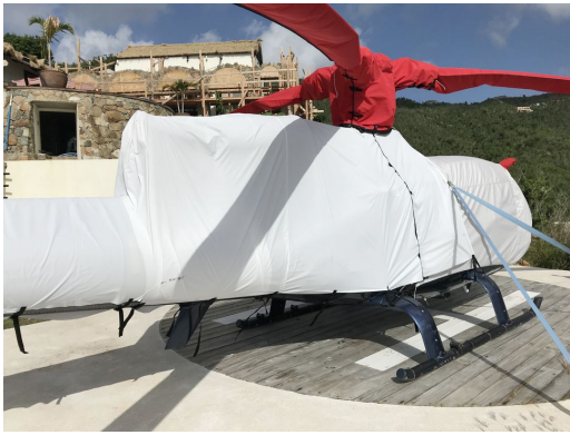
Aerospatiale Gazelle AS341 Bubble, Rotor Mast, Blade, Engine & Tailboom Covers (some are test fit covers)