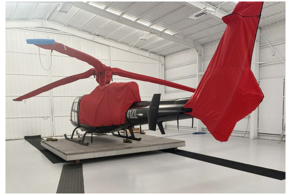
Aerospatiale Gazelle Engine, Rotor Hub, Blades & Tailfan Covers