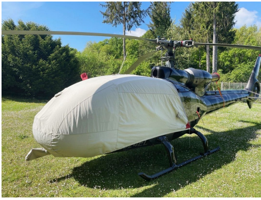
Aerospatiale Gazelle Bubble Cover