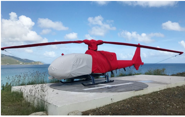
Aerospatiale AS341/342 Gazelle Full Cover Set