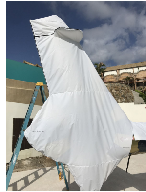
Aerospatiale Gazelle AS341 Tailfan Housing Extended Cover (test fit cover)