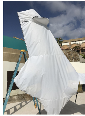
Aerospatiale Gazelle AS341 Tailfan Housing Extended Cover (test fit cover)