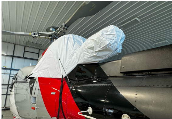
Airbus Helicopter AS350-B3 Intake/Exhaust Cover, test fit cover

WINTER USE MATERIAL - Made with Solution-Dyed Polyester fabric, this option is intended for seasonal use to aid in deicing, rain mitigation, or for occasional travel. The material is lighter and more compact, but more susceptible to UV damage and may have a shorter useful life if used continuously outside than the all-year use material.