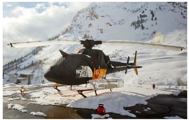
AS350 Insulated Bubble, Engine & Rotor Hub Covers