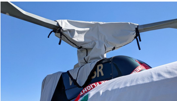
AS350 Main Rotor & Intake Covers

WINTER USE MATERIAL - Made with Solution-Dyed Polyester fabric, this option is intended for seasonal use to aid in deicing, rain mitigation, or for occasional travel. The material is lighter and more compact, but more susceptible to UV damage and may have a shorter useful life if used continuously outside than the all-year use material.