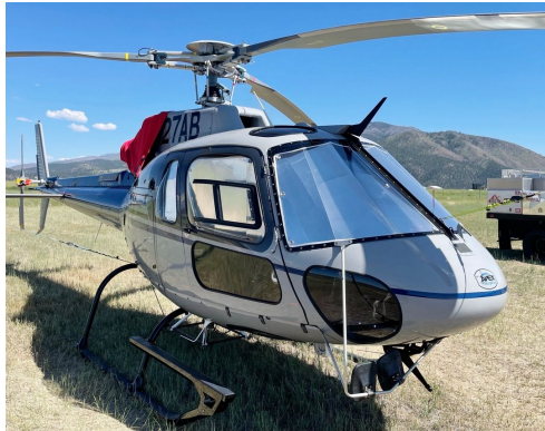
Eurocopter AS350-B3 Cabin HeatShields, Intake/Exhaust Cover

Heatshields are interior sunshades for an aircraft's windows or canopy glass. The product is a unique composite of closed-cell foam with a silver mylar finish. The semi-rigid design is stiff enough to stand along the inside of the windshield using sun visors or window framing. It folds up flat and easily stores in the included storage sleeve. Some designs may require velcro and suction cups. A Heatshield is an excellent short-term remedy for cockpit overheating.