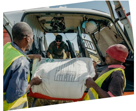
AS350 Windshield Heatshields