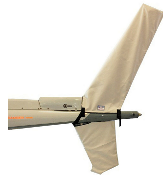
AS350B3 Vertical Stabilizers cover