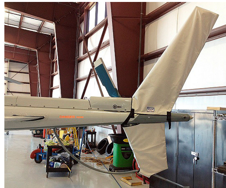
AS350 B3 Vertical Stabilizer Covers (set of 2)