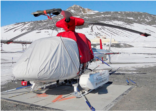
AS350 Bubble Cover w/ Cargo Mirror, Blade Tie-downs, Insulated Engine, Insulated Main Rotor Hub and Insulated Tail Rotor Covers

WINTER USE MATERIAL - Made with Solution-Dyed Polyester fabric, this option is intended for seasonal use to aid in deicing, rain mitigation, or for occasional travel. The material is lighter and more compact, but more susceptible to UV damage and may have a shorter useful life if used continuously outside than the all-year use material.