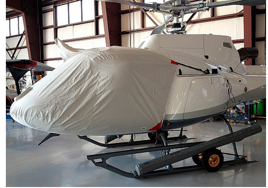
AS350 B3 Bubble Cover