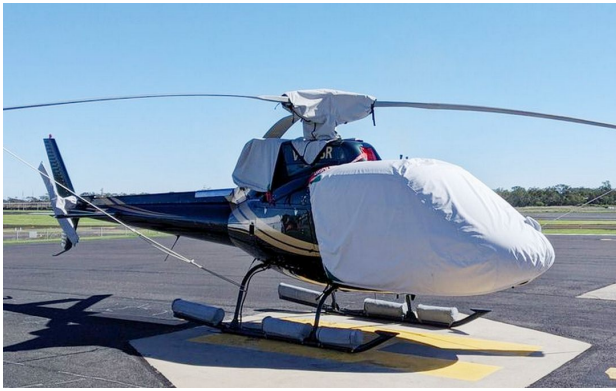
AS350 Bubble, Main Rotor, Intake & Tail Rotor Covers