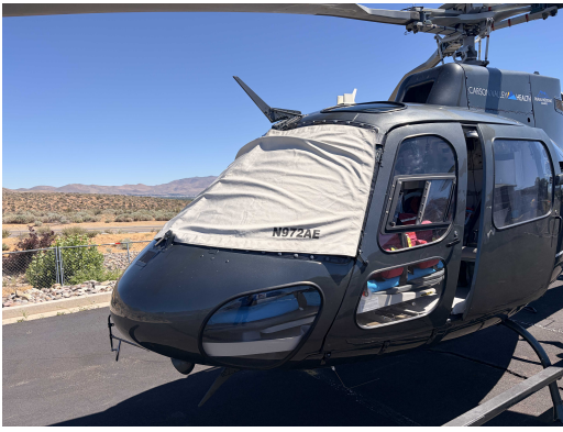
Airbus Helicopter AS350B3 Windshield Cover