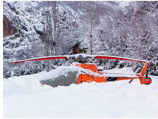
AS350 Bubble Cover, Insulated Main & Tail Rotor Covers, Blade Covers with tie-down detail