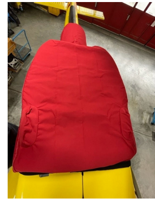
Airbus Helicopter H-125 & AS350 Intake/Exhaust Cover (newer design)