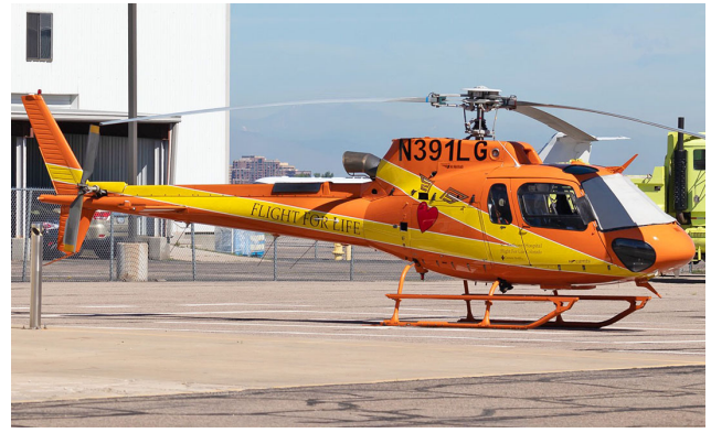
Airbus H125 Bubble Cover with Wire Strike and External Mirror Aerospatiale AS350 Astar, Ecureuil, Esquilo, Fennec Bubble Cover