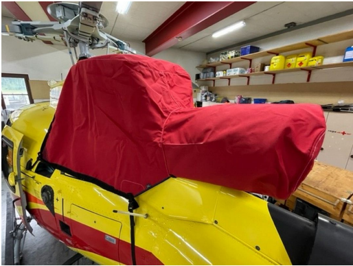
Airbus Helicopter H-125 & AS350 Intake/Exhaust Cover (newer design)