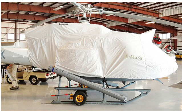
Eurocopter AS350 Main Body Cover