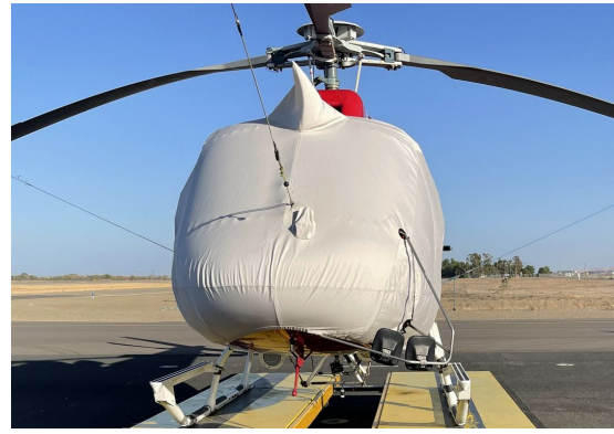
Airbus H125 Bubble Cover with Wire Strike and External Mirror