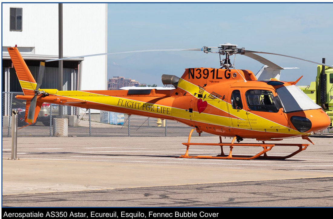
Aerospatiale AS350 Astar, Ecureuil, Esquilo, Fennec Bubble Cover