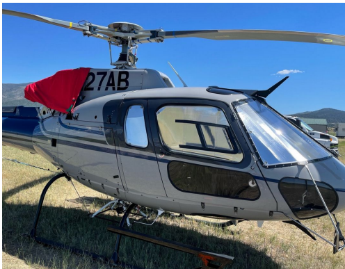
Eurocopter AS350-B3 Cabin HeatShields, Intake/Exhaust Cover

Heatshields are interior sunshades for an aircraft's windows or canopy glass. The product is a unique composite of closed-cell foam with a silver mylar finish. The semi-rigid design is stiff enough to stand along the inside of the windshield using sun visors or window framing. It folds up flat and easily stores in the included storage sleeve. Some designs may require velcro and suction cups. A Heatshield is an excellent short-term remedy for cockpit overheating.