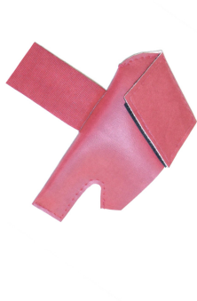
AS350 Pitot Cover

imprinted with the aircraft registration number in black for an extra charge. Storage bag NOT included. Engine plugs may be inserted after flight when the engine is still warm. Engine Inlet Plugs are commonly referred to as Cowl Plugs, Intake Plugs, Cowl Blocks, Engine Blocks, and Engine Bunges.