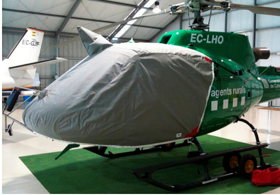
AS350 Bubble Cover with Wire Strike and Cargo Mirror

Travel Covers are made with Silver Solution-Dyed Polyester fabric and fully lined over the entire cover. The material is lightweight and more compact for easy storage in the aircraft. The polyester material is water resistant, but only intended for occasional use outside. We also have an ultra lightweight material available for fitted hangar dust covers. For daily outdoor use, the non-travel Sunbrella Cover is the best choice.