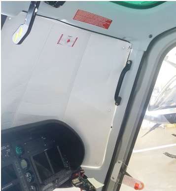
Aerospatiale AS350 Astar, Ecureuil, Esquilo, Fennec Windshield Heatshields