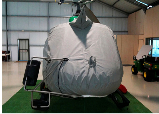
AS350 Bubble Cover with Wire Strike and Cargo Mirror