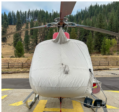
Eurocopter AS350-B3 Bubble Cover w/Wire Strike & Cargo Mirror details.

Travel Covers are made with Silver Solution-Dyed Polyester fabric and fully lined over the entire cover. The material is lightweight and more compact for easy stowage in the aircraft. The polyester material is water resistant, but only intended for occasional use outside. We also have an ultra lightweight material available for fitted hangar dust covers. For daily outdoor use, the non-travel Sunbrella Cover is the best choice.