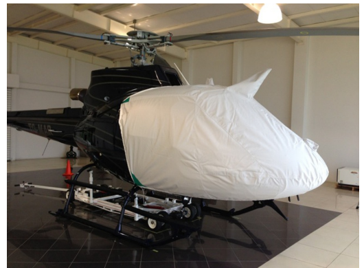
AS350 Bubble Cover