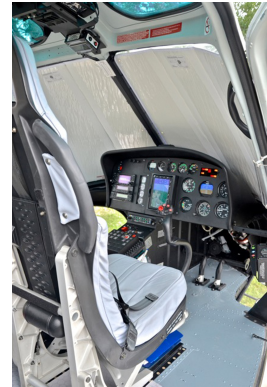
AS350 Windshield HeatShields