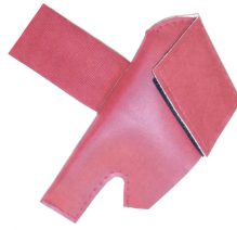
AS350 Pitot Cover

imprinted with the aircraft registration number in black for an extra charge. Storage bag NOT included. Engine plugs may be inserted after flight when the engine is still warm. Engine Inlet Plugs are commonly referred to as Cowl Plugs, Intake Plugs, Cowl Blocks, Engine Blocks, and Engine Bunges.