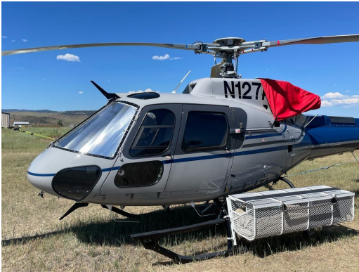
Eurocopter AS350-B3 Cabin HeatShields, Intake/Exhaust Cover

Heatshields are interior sunshades for an aircraft's windows or canopy glass. The product is a unique composite of closed-cell foam with a silver mylar finish. The semi-rigid design is stiff enough to stand along the inside of the windshield using sun visors or window framing. It folds up flat and easily stores in the included storage sleeve. Some designs may require velcro and suction cups. A Heatshield is an excellent short-term remedy for cockpit overheating.