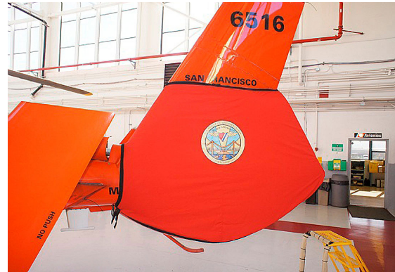
MH-365C Dauphin Tail Fan Fenestron Cover