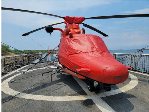
Aerospatiale AS365N2 Bubble, w/Extended Nose/Radome

This cover type is made from Silver Acrylic Sunbrella canvas and is 100% lined with a soft and smooth microfiber. Bruce's Custom Covers developed this material combination especially for aircraft protection. The outer material is medium weight and treated for water resistance, UV resistance and anti-static buildup. The inner lining is a very soft and smooth microfiber to prevent scratching. The material is very reflective, and tests show that the cabin interior temperature can be reduced to near-ambient temperature on the hottest of days. It is water, ice and snow repellent, yet breathable to allow moisture to escape from between the cover and the aircraft surface.