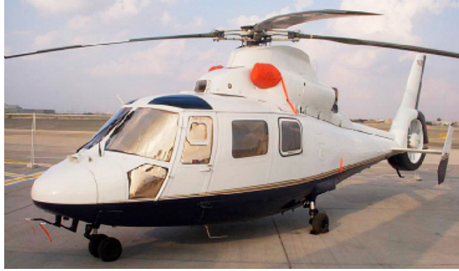
Dauphin HeatShield Set

foam with a silver mylar finish. The semi-rigid design is stiff enough to stand along the inside of the windshield using sun visors or window framing. It folds up flat and easily stores in the included storage sleeve. Some designs may require velcro and suction cups. A Heatshield is an excellent short-term remedy for cockpit overheating.