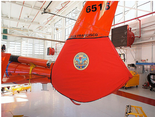
MH-365C Dauphin Tail Fan Fenestron Cover

The Tailboom Cover details vary by model, but generally the helicopter tail boom cover encloses the tail boom from the "bottleneck" to the aft end. They usually also cover the horizontal stabilizers, and are custom made to allow for antennae, lights, and other protrusions. They attach with straps underneath the tail boom. Covers for the vertical and horizontal stabilizers are also available separately. Specific information for each model is available on request.