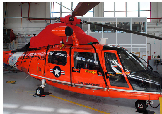
MH-65C Rotor Hub, Swash Plate Aperture, Engine Area Cover set, P/N: A365-210 MH-65C Engine Area Cover, Swash Plate Aperture, Rotor Hub cover set, P/N: A365-210