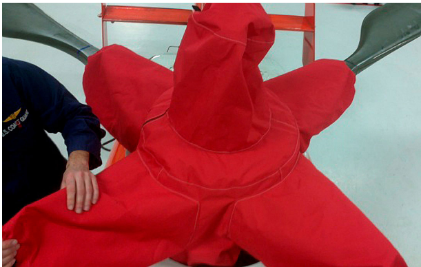
MH-65C Rotor Hub, Swash Plate Aperture, Engine Area Cover set, P/N: A365-210