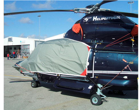
Dauphin Bubble Cover, extended nose