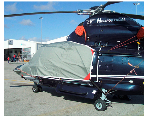
Dauphin Bubble Cover, extended nose