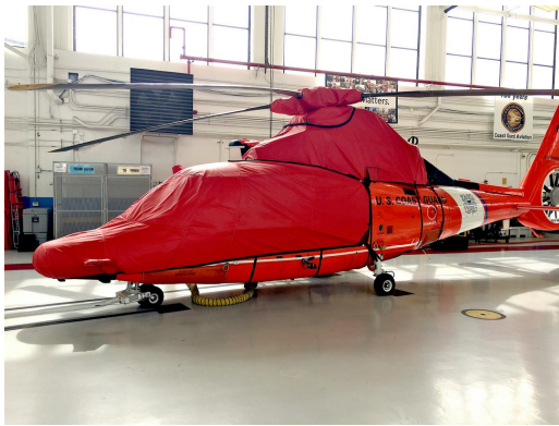
U.S. Coast Guard HH-65 Dolphin Bubble, Engine & Rotor Mast Covers

Travel Covers are made with Silver Solution-Dyed Polyester fabric and fully lined over the entire cover. The material is lightweight and more compact for easy storage in the aircraft. The polyester material is water resistant, but only intended for occasional use outside. We also have an ultra lightweight material available for fitted hangar dust covers. For daily outdoor use, the non-travel Sunbrella Cover is the best choice.