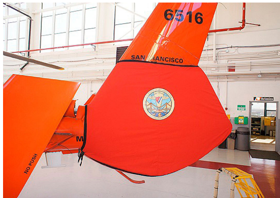
MH-365C Dauphin Tail Fan Fenestron Cover

The Tailboom Cover details vary by model, but generally the helicopter tail boom cover encloses the tail boom from the "bottleneck" to the aft end. They usually also cover the horizontal stabilizers, and are custom made to allow for antennae, lights, and other protrusions. They attach with straps underneath the tail boom. Covers for the vertical and horizontal stabilizers are also available separately. Specific information for each model is available on request.