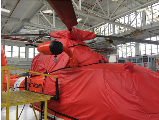
U.S. Coast Guard HH-65 Dolphin Bubble, Engine & Rotor Mast Covers

This cover type is made from Silver Acrylic Sunbrella canvas and is 100% lined with a soft and smooth microfiber. Bruce's Custom Covers developed this material combination especially for aircraft protection. The outer material is medium weight and treated for water resistance, UV resistance and anti-static buildup. The inner lining is a very soft and smooth microfiber to prevent scratching. The material is very reflective, and tests show that the cabin interior temperature can be reduced to near-ambient temperature on the hottest of days. It is water, ice and snow repellent, yet breathable to allow moisture to escape from between the cover and the aircraft surface.