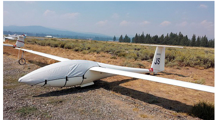
ASW-20C Canopy/Nose Cover