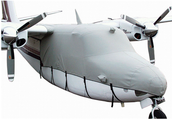
Canopy/Nose Cover (extends over top past leading edge)

Travel Covers are made with Silver Solution-Dyed Polyester fabric and only lined over the windshield to save weight. The material is lightweight and more compact for easy stowage in the aircraft. The polyester material is water resistant, but only intended for occasional use outside. We also have an ultra lightweight material available for fitted hangar dust covers. For daily outdoor use, the non-travel Sunbrella Cover is the best choice.