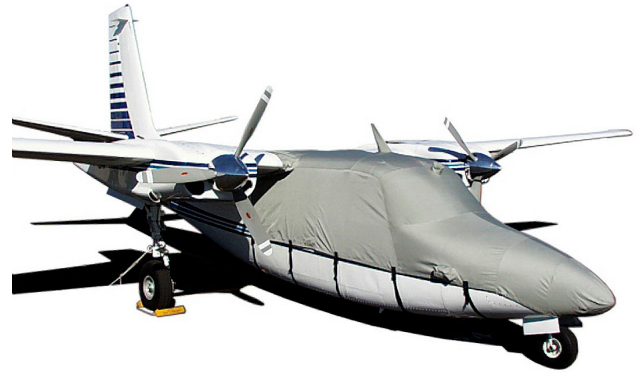
Aero Commander 500S Canopy/Nose Cover