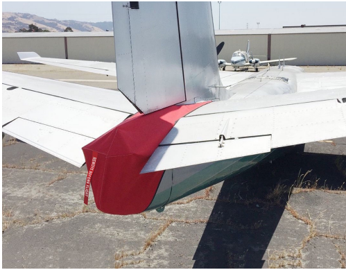
Rockwell Aero Commander Tailcone Cover

WINTER USE MATERIAL - Made with Solution-Dyed Polyester fabric, this option is intended for seasonal use to aid in deicing, rain mitigation, or for occasional travel. The material is lighter and more compact, but more susceptible to UV damage and may have a shorter useful life if used continuously outside than the all-year use material.