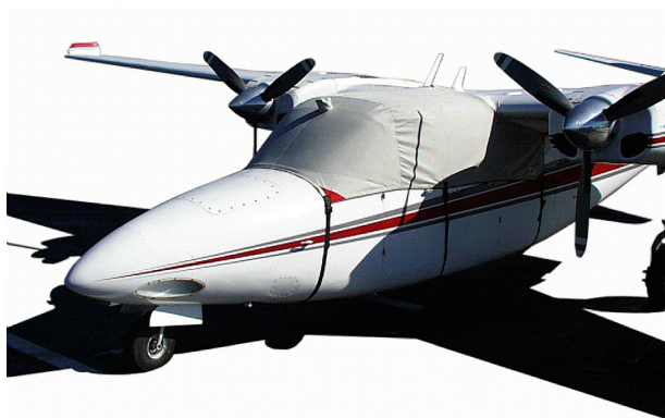
Aero Commander 680 Canopy Cover