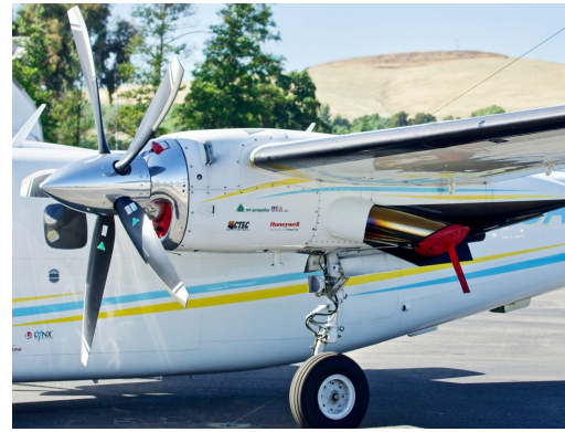
Aero Commander 690B Engine Inlet & Exhaust Plugs