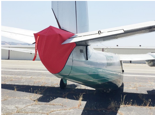
Rockwell Aero Commander Tailcone Cover