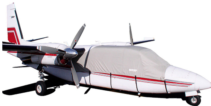
Aero Commander 690b Canopy Cover