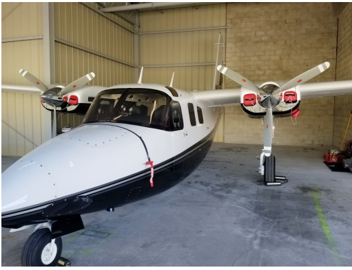
Aero Commander 500-A Pitot Covers