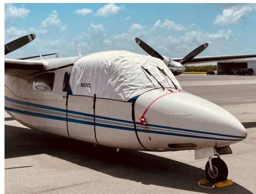
Aero Commander 690C Cockpit Cover