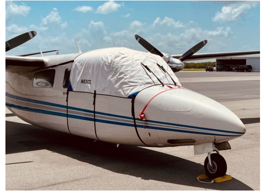
Aero Commander 690C Cockpit Cover