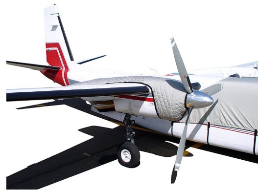
Aero Commander Insulated Engine Cover