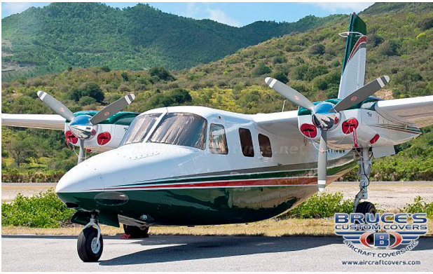
Aero Commander 500 Engine Inlet Plugs