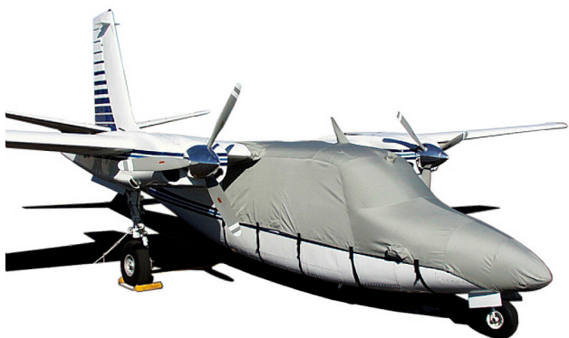
Aero Commander 500S Canopy/Nose Cover