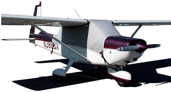
Lark Canopy Cover