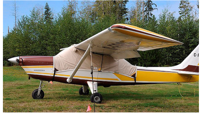
Lark Canopy Cover