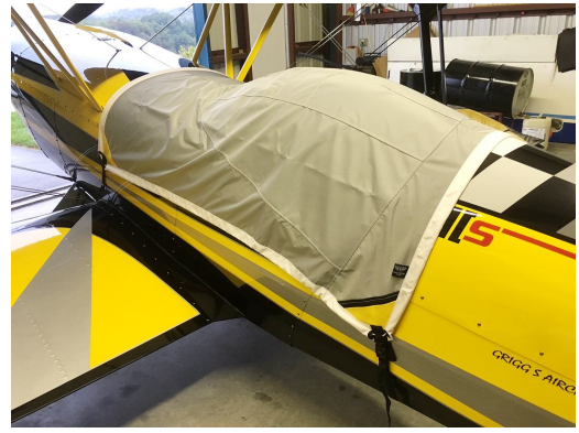
Acro Sport Acro II, Acroduster Travel Cover, Light Weight Travel Canopy Cover