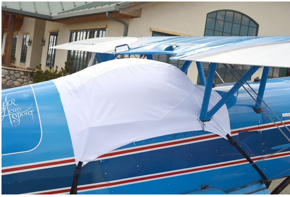
Acro Sport Canopy Cover