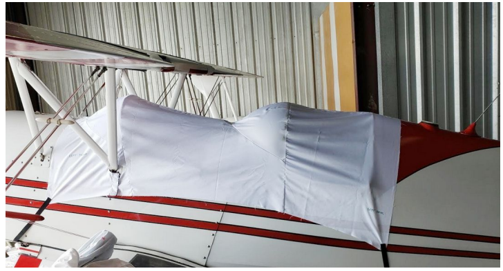
Acro Sport 2 Canopy Cover, test fit cover