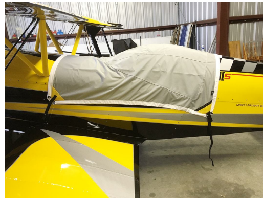
Acro Sport Acro II, Acroduster Travel Cover, Light Weight Travel Canopy Cover