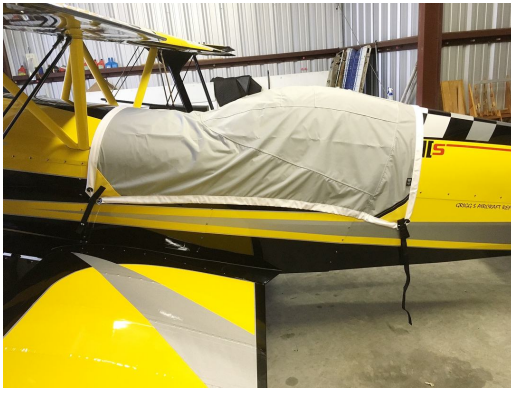
Acro Sport Acro II, Acroduster Travel Cover, Light Weight Travel Canopy Cover