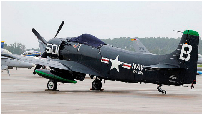
Douglas Skyraider Canopy Cover