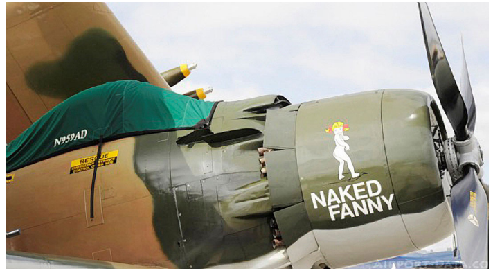
Douglas Skyraider Canopy Cover