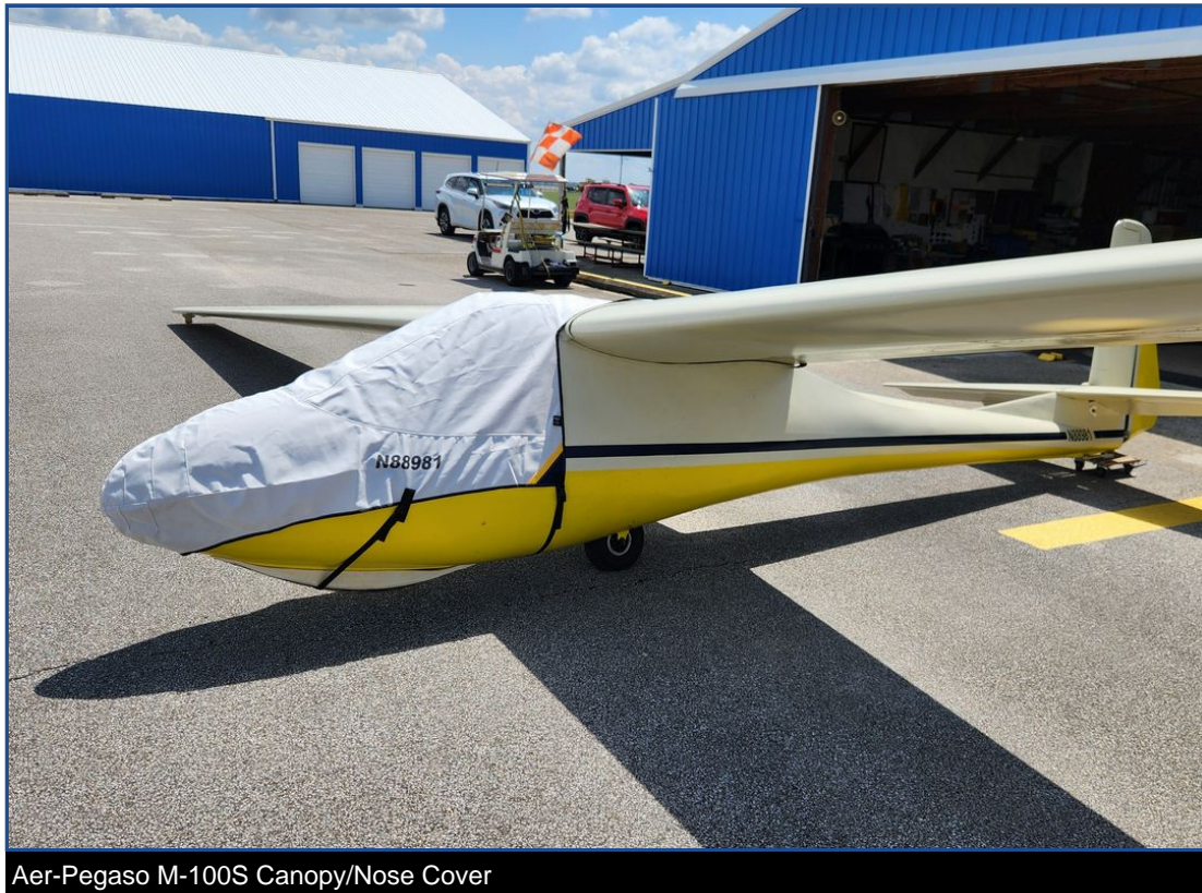
Aer-Pegaso M-100S Canopy/Nose Cover