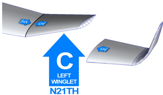
Sailplane Full Cover Set Graphic Indicators (Discus 2B, 3D model)

WINTER USE MATERIAL - Made with Solution-Dyed Polyester fabric, this option is intended for seasonal use to aid in deicing, rain mitigation, or for occasional travel. The material is lighter and more compact, but more susceptible to UV damage and may have a shorter useful life if used continuously outside than the all-year use material.