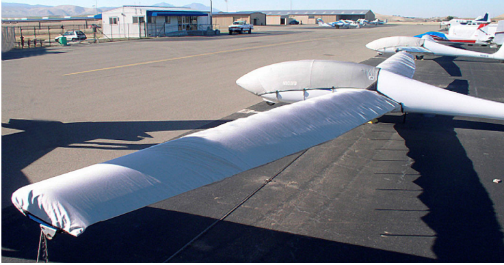
Grob 103 Canopy/Nose Cover and Wing Covers

Designed to prevent damage to the wingtip in crowded hangars or high traffic areas, these products are made of bright red Naugahyde and thickly padded with a sandwich of closed cell foam. Protects delicate winglets, casters and their housings, and soft finishes.