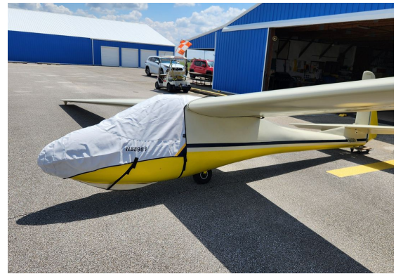
Aer-Pegaso M-100S Canopy/Nose Cover