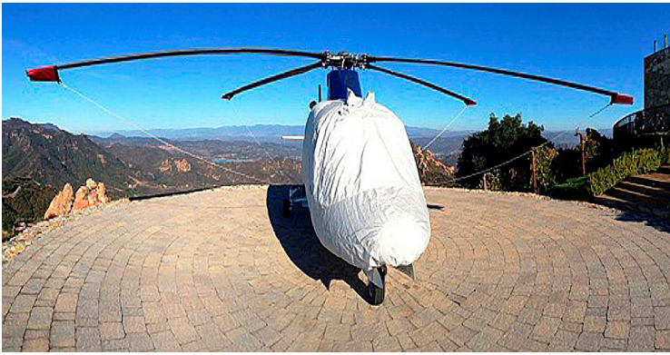
Agusta 109 Mk II+ Bubble Cover and Blade Tie-downs