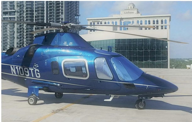
Agusta AW109 Power, A109E Heatshield Set

A Heatshield is an excellent short-term remedy for cockpit overheating.