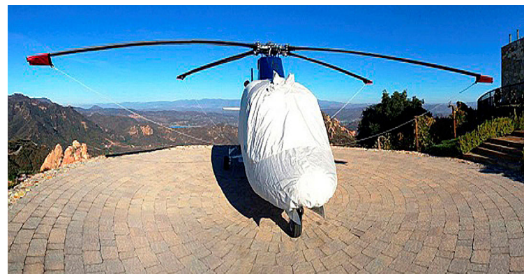
Agusta 109 Mk II+ Bubble Cover and Blade Tie-downs

WINTER USE MATERIAL - Made with Solution-Dyed Polyester fabric, this option is intended for seasonal use to aid in deicing, rain mitigation, or for occasional travel. The material is lighter and more compact, but more susceptible to UV damage and may have a shorter useful life if used continuously outside than the all-year use material.