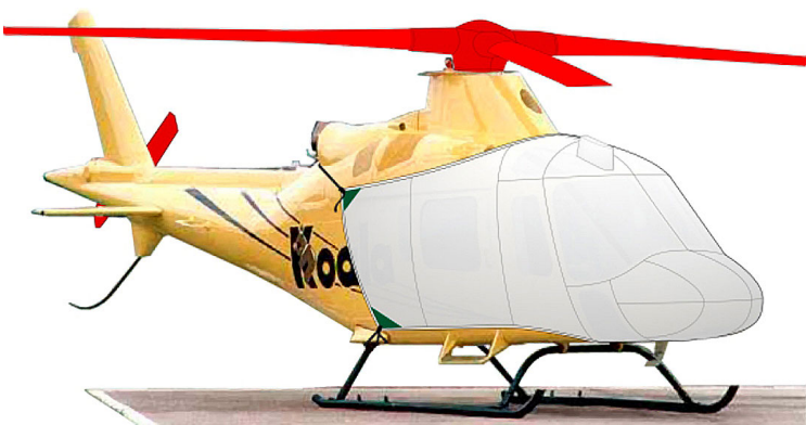
Koala Bubble, Rotor Hub, Blade & Tail Rotor Covers (illustration)