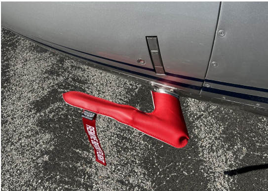
Agusta Power Pitot Covers, Intake Covers, and Cockpit Heatshield set