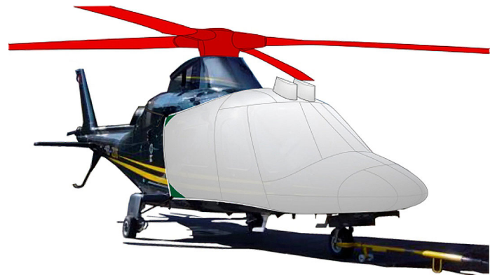
Agusta 109 Bubble, Rotor Hub & Blade Covers (illustration)