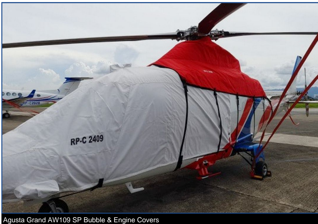
Agusta Grand AW109 SP Bubble &amp; Engine Covers