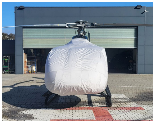
Airbus Helicopter H-130 Bubble Cover, Extends To Cover Fwd Engine Inlet