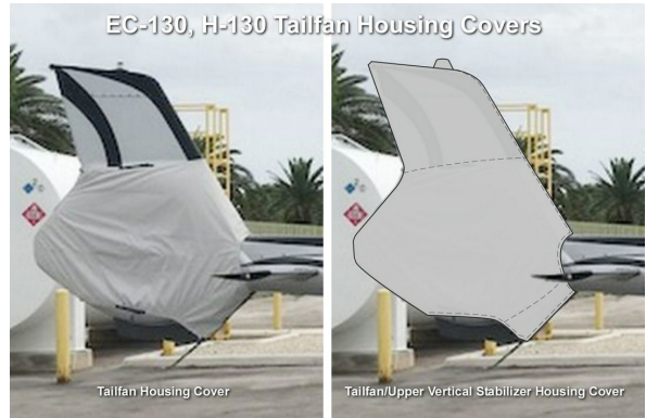
Airbus Helicopter H-130 Tailfan Housing Covers