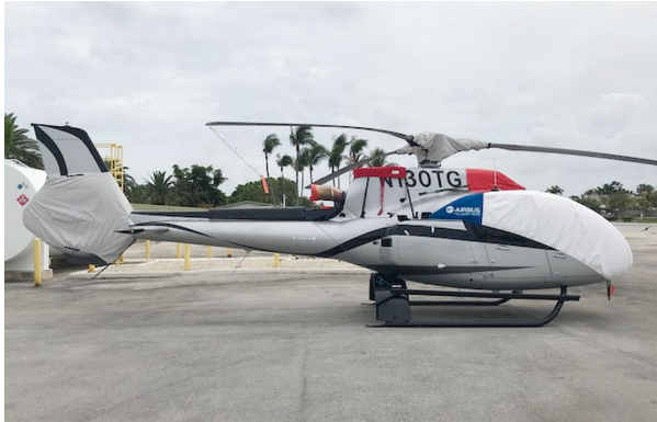
AIRBUS H130 T2, Intake, Exhaust & Tailfan Covers

The Tailboom Cover details vary by model, but generally the helicopter tail boom cover encloses the tail boom from the "bottleneck" to the aft end. They usually also cover the horizontal stabilizers, and are custom made to allow for antennae, lights, and other protrusions. They attach with straps underneath the tail boom. Covers for the vertical and horizontal stabilizers are also available separately. Specific information for each model is available on request.