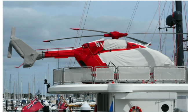
Eurocopter EC-135 Bubble, Engine, Rotor Hub, Tail Surfaces Covers