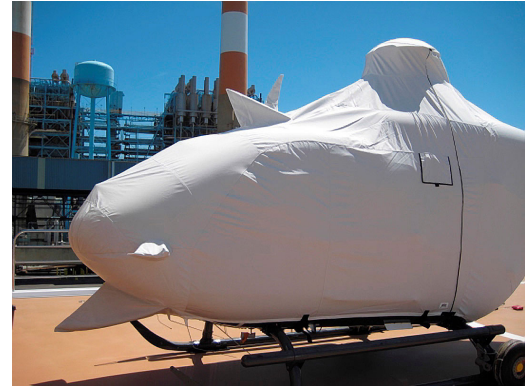
EC-135 Fuselage Cover