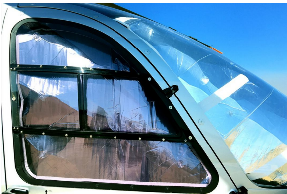
Airbus EC-135 Cockpit HeatShields

Heatshields are interior sunshades for an aircraft's windows or canopy glass. The product is a unique composite of closed-cell foam with a silver mylar finish. The semi-rigid design is stiff enough to stand along the inside of the windshield using sun visors or window framing. It folds up flat and easily stores in the included storage sleeve. Some designs may require velcro and suction cups. A Heatshield is an excellent short-term remedy for cockpit overheating.