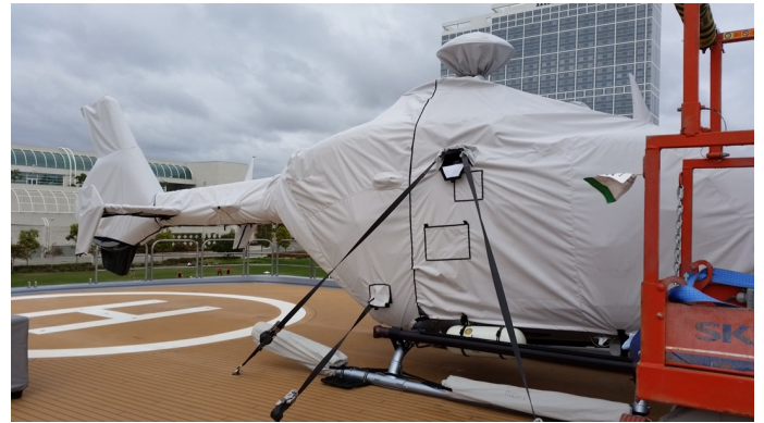
EC-135 Full Cover Set