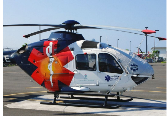
Eurocopter EC-135 Windshield/Skylight Cover