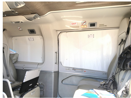
Eurocopter EC-145 Cabin Heatshields