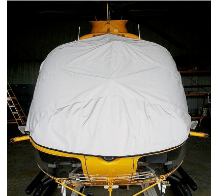
Airbus Helicopter EC-145 Bubble Cover with Radome & Wire Strike EC-135 Windshield/Skylights Cover, pinches in door jambs