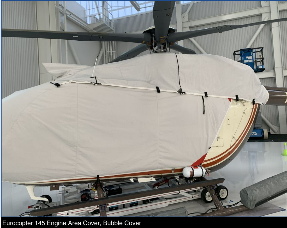
Eurocopter 145 Engine Area Cover, Bubble Cover