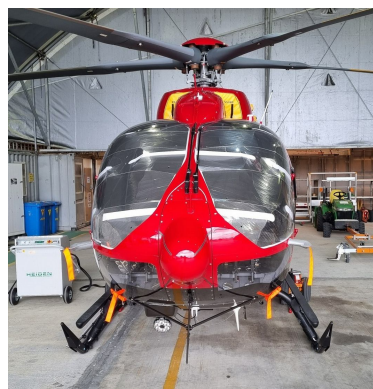
Airbus Helicopter H145D3 Windshield Heatshields, Engine Plugs