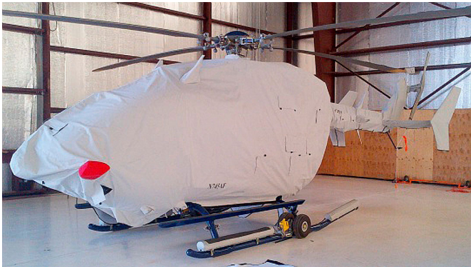
Main Body (also covers bottom), Tailboom, Vertical Pylon, Stabilizers and Tail Rotor Covers

This cover type is made from Silver Acrylic Sunbrella canvas and is 100% lined with a soft and smooth microfiber. Bruce's Custom Covers developed this material combination especially for aircraft protection. The outer material is medium weight and treated for water resistance, UV resistance and anti-static buildup. The inner lining is a very soft and smooth microfiber to prevent scratching. The material is very reflective, and tests show that the cabin interior temperature can be reduced to near-ambient temperature on the hottest of days. It is water, ice and snow repellent, yet breathable to allow moisture to escape from between the cover and the aircraft surface.