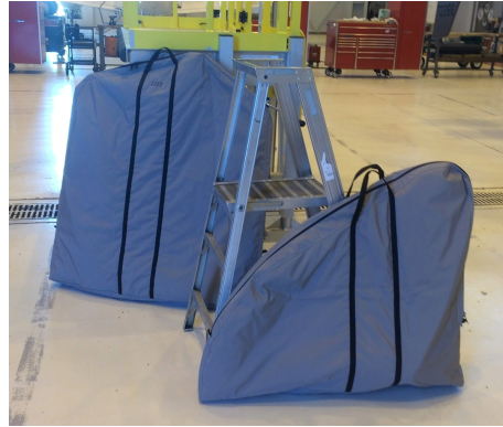
Eurocopter EC-145 Padded Bags for Removable Doors