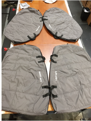
MD 500D Padded Door Bags

**Padded Door Bags* are designed to provide portable protection of the doors when they are removed from the aircraft. They are padded to moderate thickness, zippered closed, and have sturdy carry handles for easy transport.