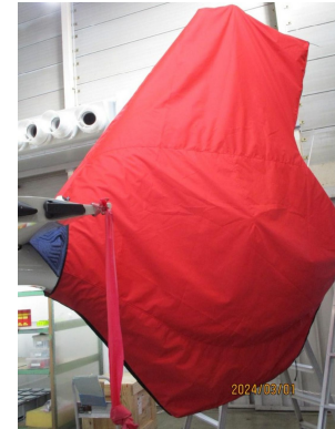
Eurocopter EC-145 D2 Main Body Cover, Tailboom/Fenestron Cover