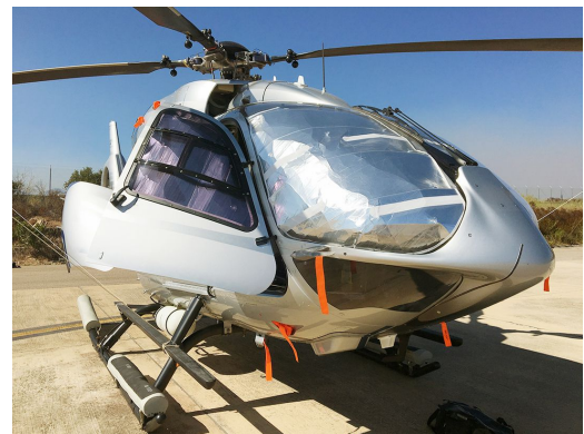
Eurocopter EC-145 Cockpit Heatshields