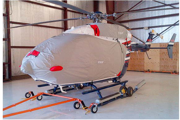
Bubble Cover w/ nose mounted radome & Upper Deck Plugs/Cover