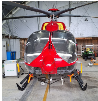
Airbus Helicopter H145D3 Windshield Heatshields, Engine Plugs