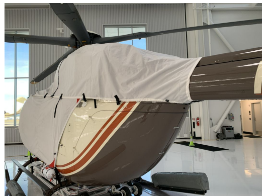
Eurocopter 145 Engine Area Cover, Bubble Cover