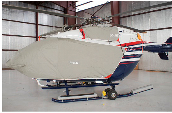
Bubble Cover w/ nose mounted radome, Upper Deck Plugs/Cover