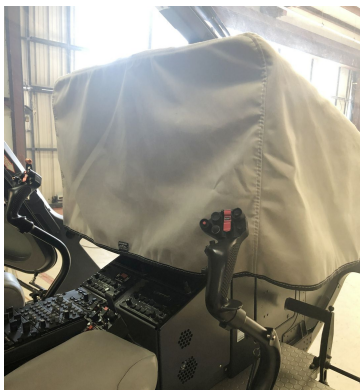
Eurocopter EC-135 Instrument Panel Heatshield Cover

Heatshields are interior sunshades for an aircraft's windows or canopy glass. The product is a unique composite of closed-cell foam with a silver mylar finish. The semi-rigid design is stiff enough to stand along the inside of the windshield using sun visors or window framing. It folds up flat and easily stores in the included storage sleeve. Some designs may require velcro and suction cups. A Heatshield is an excellent short-term remedy for cockpit overheating.