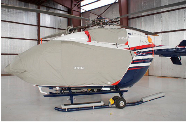
Bubble Cover w/ nose mounted radome, Upper Deck Plugs/Cover

This cover type is made from Silver Acrylic Sunbrella canvas and is 100% lined with a soft and smooth microfiber. Bruce's Custom Covers developed this material combination especially for aircraft protection. The outer material is medium weight and treated for water resistance, UV resistance and anti-static buildup. The inner lining is a very soft and smooth microfiber to prevent scratching. The material is very reflective, and tests show that the cabin interior temperature can be reduced to near-ambient temperature on the hottest of days. It is water, ice and snow repellent, yet breathable to allow moisture to escape from between the cover and the aircraft surface.