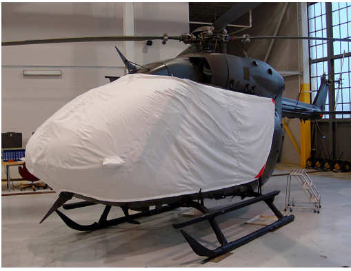
EC-145 Bubble Cover