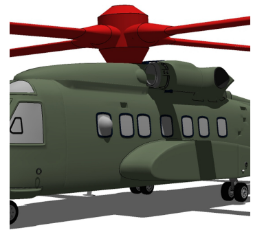
Sikorsky S-92 Main Rotor Hub Cover