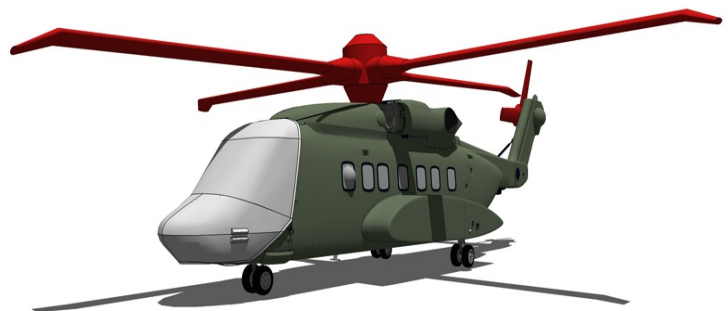
Sikorsky S-92 Windshield/Nose, Blade, Rotor Hub & Tail Rotor Covers