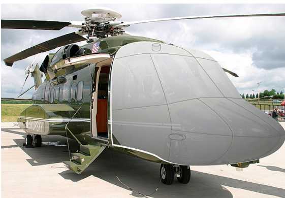
Sikorsky S-92 Windshield/Nose Cover (illustration)

This cover type is made from Silver Acrylic Sunbrella canvas and is 100% lined with a soft and smooth microfiber. Bruce's Custom Covers developed this material combination especially for aircraft protection. The outer material is medium weight and treated for water resistance, UV resistance and anti-static buildup. The inner lining is a very soft and smooth microfiber to prevent scratching. The material is very reflective, and tests show that the cabin interior temperature can be reduced to near-ambient temperature on the hottest of days. It is water, ice and snow repellent, yet breathable to allow moisture to escape from between the cover and the aircraft surface.