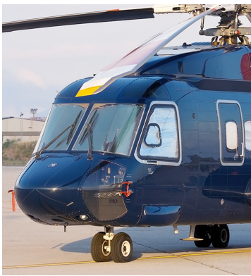
Sikorsky S-92 Cockpit HeatShields