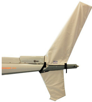
AS350B3 Vertical Stabilizers cover

The Tailboom Cover details vary by model, but generally the helicopter tail boom cover encloses the tail boom from the "bottleneck" to the aft end. They usually also cover the horizontal stabilizers, and are custom made to allow for antennae, lights, and other protrusions. They attach with straps underneath the tail boom. Covers for the vertical and horizontal stabilizers are also available separately. Specific information for each model is available on request.