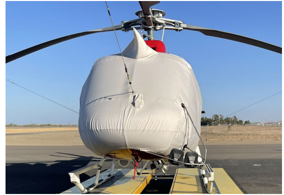
Airbus H125 Bubble Cover with Wire Strike and External Mirror