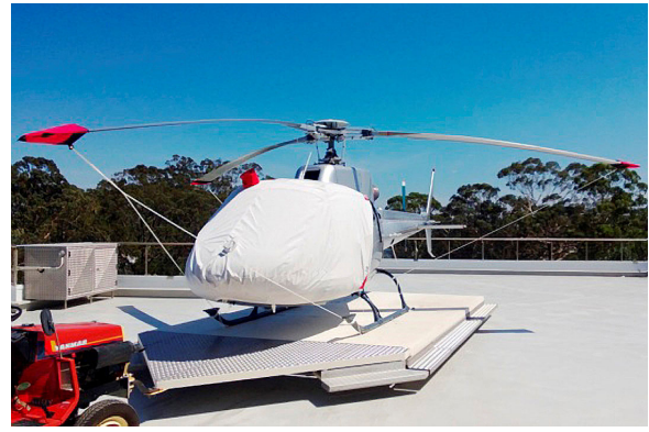
AS350 Bubble Cover, Blade Tie-downs