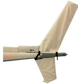
AS350B3 Vertical Stabilizers cover