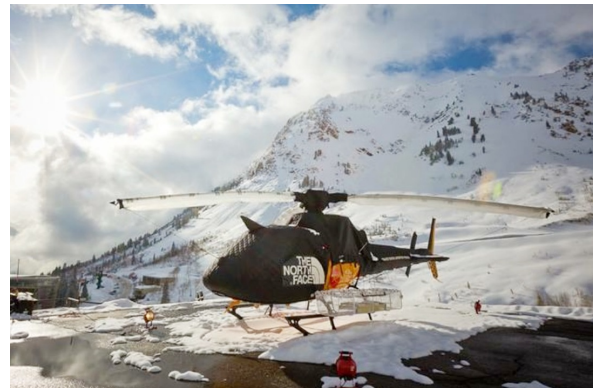
AS350 Insulated Bubble, Engine & Rotor Hub Covers