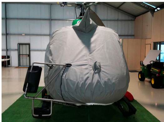
AS350 Bubble Cover with Wire Strike and Cargo Mirror