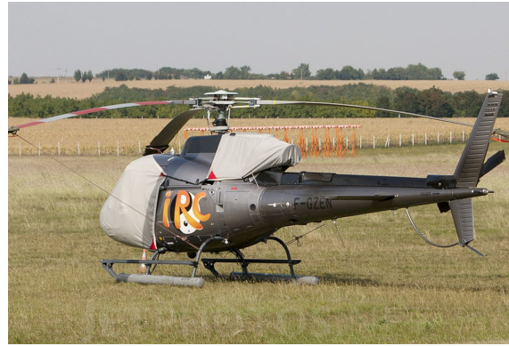
Airbus H125 Bubble Cover with Wire Strike and External Mirror Airbus Helicopter AS350 Bubble Cover & Intake/Exhaust Cover