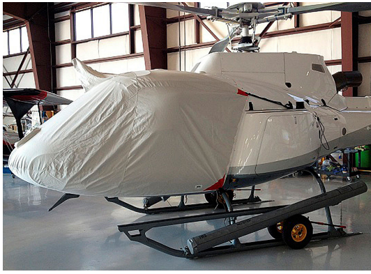
AS350 B3 Bubble Cover