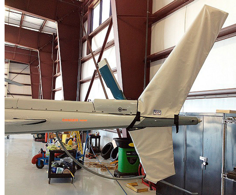
AS350 B3 Vertical Stabilizer Covers (set of 2)