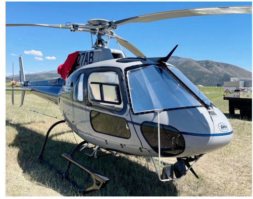
Eurocopter AS350-B3 Cabin HeatShields, Intake/Exhaust Cover