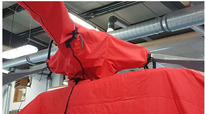
H125 TAIL ROTOR COVER