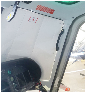
Aerospatiale AS350 Astar, Ecureuil, Esquilo, Fennec Windshield Heatshields