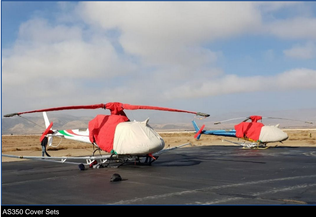
AS350 Cover Sets