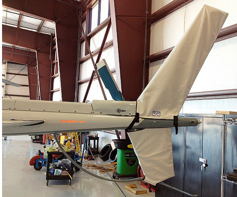
AS350 B3 Vertical Stabilizer Covers (set of 2)

The Tailboom Cover details vary by model, but generally the helicopter tail boom cover encloses the tail boom from the "bottleneck" to the aft end. They usually also cover the horizontal stabilizers, and are custom made to allow for antennae, lights, and other protrusions. They attach with straps underneath the tail boom. Covers for the vertical and horizontal stabilizers are also available separately. Specific information for each model is available on request.