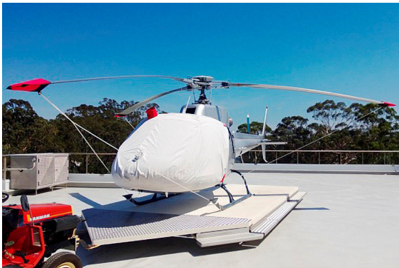
AS350 Bubble Cover, Blade Tie-downs

WINTER USE MATERIAL - Made with Solution-Dyed Polyester fabric, this option is intended for seasonal use to aid in deicing, rain mitigation, or for occasional travel. The material is lighter and more compact, but more susceptible to UV damage and may have a shorter useful life if used continuously outside than the all-year use material.