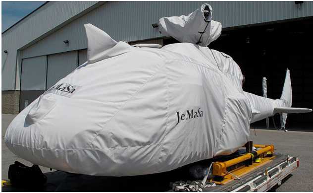
AS350 Main Body Cover, Main Rotor Hub, Tailboom, Tail Rotor Covers

water resistance, UV resistance and anti-static buildup. The inner lining is a very soft and smooth microfiber to prevent scratching. The material is very reflective, and tests show that the cabin interior temperature can be reduced to near-ambient temperature on the hottest of days. It is water, ice and snow repellent, yet breathable to allow moisture to escape from between the cover and the aircraft surface.