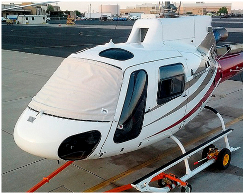
AS350 Windshield Cover, pinches in door jambs