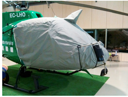
AS350 Bubble Cover with Wire Strike and Cargo Mirror