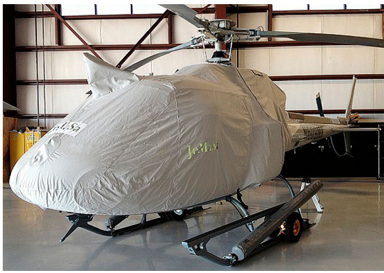
Eurocopter AS350 B3 Main Body Cover, Squirrel Cheeks