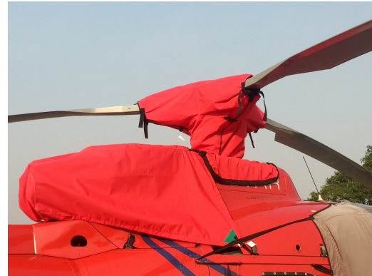
Airbus H-125 & Aerospatiale AS350 Intake/Exhaust Cover, Main Rotor Hub Cover with Weighted Skirt