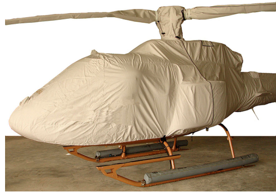
AS350 Main Body, Rotor Head, Blades and Tailboom Covers