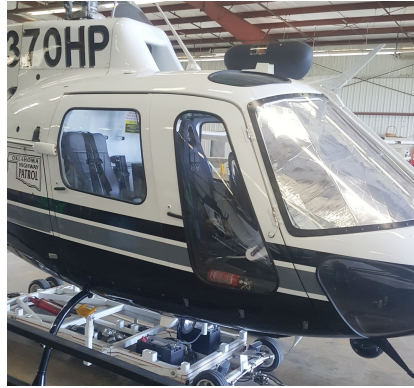
Aerospatiale AS350 Astar, Ecureuil, Esquilo, Fennec Windshield Heatshields

A Heatshield is an excellent short-term remedy for cockpit overheating.