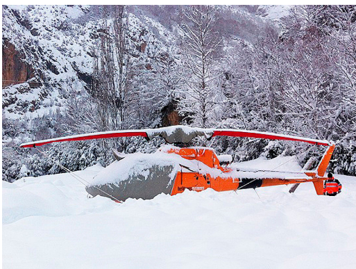
AS350 Bubble Cover, Insulated Main & Tail Rotor Covers, Blade Covers with tid-down detail

WINTER USE MATERIAL - Made with Solution-Dyed Polyester fabric, this option is intended for seasonal use to aid in deicing, rain mitigation, or for occasional travel. The material is lighter and more compact, but more susceptible to UV damage and may have a shorter useful life if used continuously outside than the all-year use material.