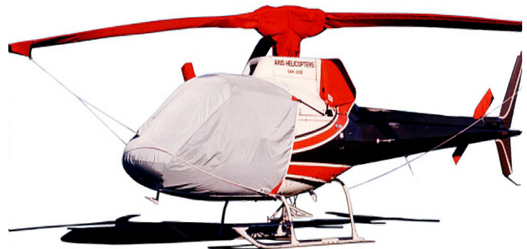
Airbus H-125 & Aerospatiale AS350 Intake/Exhaust Cover, Main Rotor Hub Cover with Weighted Skirt