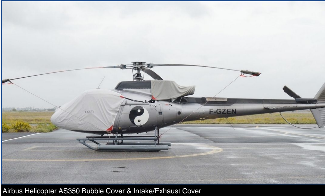
Airbus Helicopter AS350 Bubble Cover & Intake/Exhaust Cover