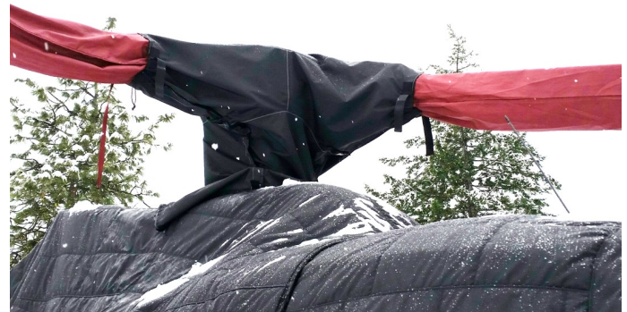
AS355 Bubble Cover w/ Cargo Mirror, Blade Tie-downs, Insulated Engine, Insulated Main Rotor Hub and Insulated Tail Rotor Covers