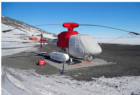
AS350 Bubble Cover w/ Cargo Mirror, Blade Tie-downs, Insulated Engine, Insulated Main Rotor Hub & Insulated Tail Rotor Covers

Travel Covers are made with Silver Solution-Dyed Polyester fabric and fully lined over the entire cover. The material is lightweight and more compact for easy stowage in the aircraft. The polyester material is water resistant, but only intended for occasional use outside. We also have an ultra lightweight material available for fitted hangar dust covers. For daily outdoor use, the non-travel Sunbrella Cover is the best choice.