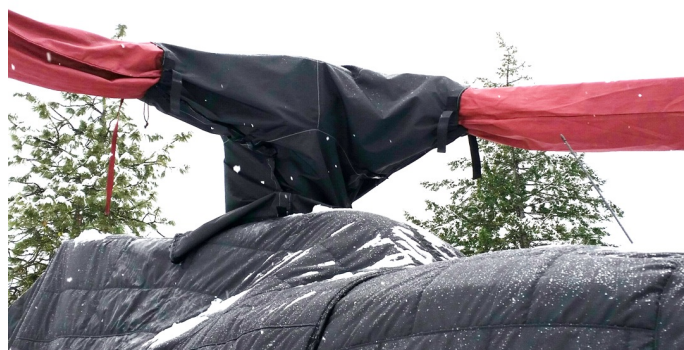
Main Rotor Hub Cover with swash plate extension.