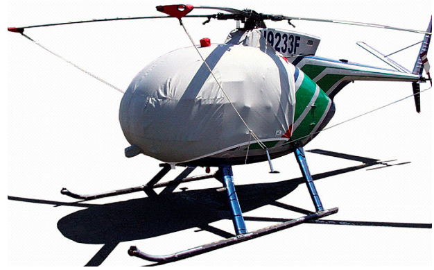
Hughes 500C Bubble Cover with Intake Add-on, Blade Tie-downs