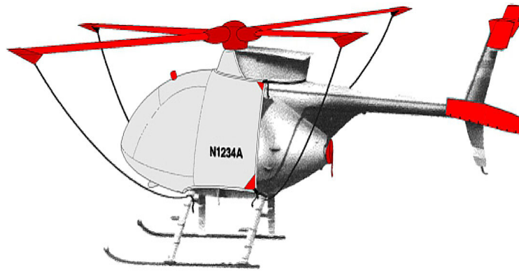
Full Cover Set