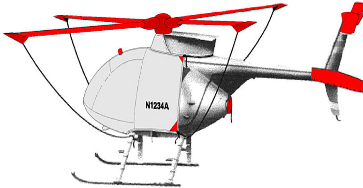
Full Cover Set

WINTER USE MATERIAL - Made with Solution-Dyed Polyester fabric, this option is intended for seasonal use to aid in deicing, rain mitigation, or for occasional travel. The material is lighter and more compact, but more susceptible to UV damage and may have a shorter useful life if used continuously outside than the all-year use material.