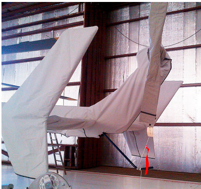
Tail Rotor Cover & Tailboom, Vertical Pylon & Stabilizers Cover

The Engine Inlet Plugs are custom fit for your Airbus Helicopter UH-72A intakes, made with heavy-duty vinyl material, and stuffed with a single block of sculpted urethane foam. Each plug has a zipper that allows the foam to be removed and dried if necessary. Engine plugs have 'Remove Before Flight' streamers sewn onto the face of the plugs. Most plugs are imprinted with the aircraft registration number in black for an extra charge. Storage bag NOT included. Engine plugs may be inserted after flight when the engine is still warm. Engine Inlet Plugs are commonly referred to as Cowl Plugs, Intake Plugs, Cowl Blocks, Engine Blocks, and Engine Bunges.