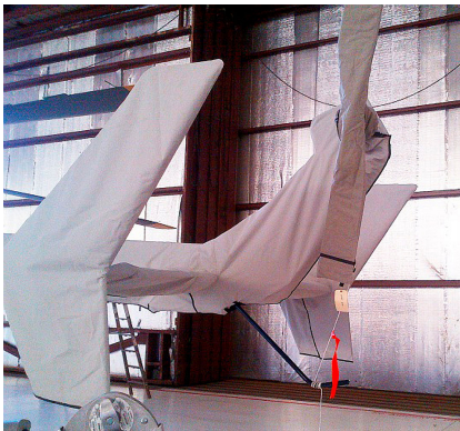
Tail Rotor Cover & Tailboom, Vertical Pylon & Stabilizers Cover

The Engine Inlet Plugs are custom fit for your Airbus Helicopter UH-72A intakes, made with heavy-duty vinyl material, and stuffed with a single block of sculpted urethane foam. Each plug has a zipper that allows the foam to be removed and dried if necessary. Engine plugs have 'Remove Before Flight' streamers sewn onto the face of the plugs. Most plugs are imprinted with the aircraft registration number in black for an extra charge. Storage bag NOT included. Engine plugs may be inserted after flight when the engine is still warm. Engine Inlet Plugs are commonly referred to as Cowl Plugs, Intake Plugs, Cowl Blocks, Engine Blocks, and Engine Bunges.