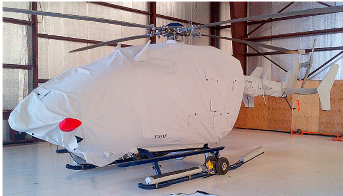
Main Body (also covers bottom), Tailboom, Vertical Pylon, Stabilizers and Tail Rotor Covers

Covers developed this material combination especially for aircraft protection. The outer material is medium weight and treated for water resistance, UV resistance and anti-static buildup. The inner lining is a very soft and smooth microfiber to prevent scratching. The material is very reflective, and tests show that the cabin interior temperature can be reduced to near-ambient temperature on the hottest of days. It is water, ice and snow repellent, yet breathable to allow moisture to escape from between the cover and the aircraft surface.