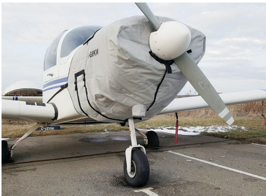
Alarus CH-2000 Insulated Engine Cover

This cover type is made from Silver Acrylic Sunbrella canvas and is 100% lined with a soft and smooth microfiber. Bruce's Custom Covers developed this material combination especially for aircraft protection. The outer material is medium weight and treated for water resistance, UV resistance and anti-static buildup. The inner lining is a very soft and smooth microfiber to prevent scratching. The material is very reflective, and tests show that the cabin interior temperature can be reduced to near-ambient temperature on the hottest of days. It is water, ice and snow repellent, yet breathable to allow moisture to escape from between the cover and the aircraft surface.