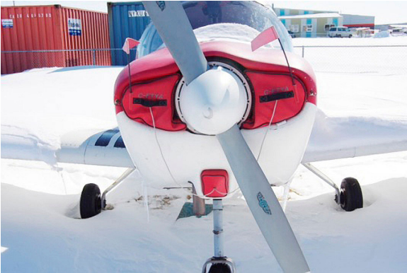
Alarus CH2000 Engine Plugs

Engine Inlet Plugs are custom fit for your Aircraft Mfg. & Development Alarus CH2000 intakes, made with heavy-duty vinyl material, and stuffed with a single block of sculpted urethane foam. Each plug has a zipper that allows the foam to be removed and dried if necessary. Engine plugs have warning flags that are visible from the cockpit or 'remove before flight' streamers sewn onto the face of the plugs. Most plugs are imprinted with the aircraft registration number in black for an extra charge. Storage bag NOT included. Engine plugs may be inserted after flight when the engine is still warm. Engine Inlet Plugs are commonly referred to as Cowl Plugs, Intake Plugs, Cowl Blocks, Engine Blocks, and Engine Bungs.