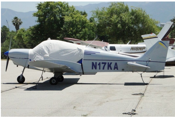
Alarus Canopy Cover

This cover type is made from Silver Acrylic Sunbrella canvas and is 100% lined with a soft and smooth microfiber. Bruce's Custom Covers developed this material combination especially for aircraft protection. The outer material is medium weight and treated for water resistance, UV resistance and anti-static buildup. The inner lining is a very soft and smooth microfiber to prevent scratching. The material is very reflective, and tests show that the cabin interior temperature can be reduced to near-ambient temperature on the hottest of days. It is water, ice and snow repellent, yet breathable to allow moisture to escape from between the cover and the aircraft surface.