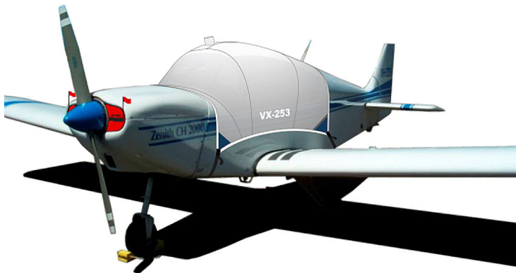
AMD Alarus CH2000 Std Canopy Cover & Engine Plugs (Illustration)

This cover type is made from Silver Acrylic Sunbrella canvas and is 100% lined with a soft and smooth microfiber. Bruce's Custom Covers developed this material combination especially for aircraft protection. The outer material is medium weight and treated for water resistance, UV resistance and anti-static buildup. The inner lining is a very soft and smooth microfiber to prevent scratching. The material is very reflective, and tests show that the cabin interior temperature can be reduced to near-ambient temperature on the hottest of days. It is water, ice and snow repellent, yet breathable to allow moisture to escape from between the cover and the aircraft surface.