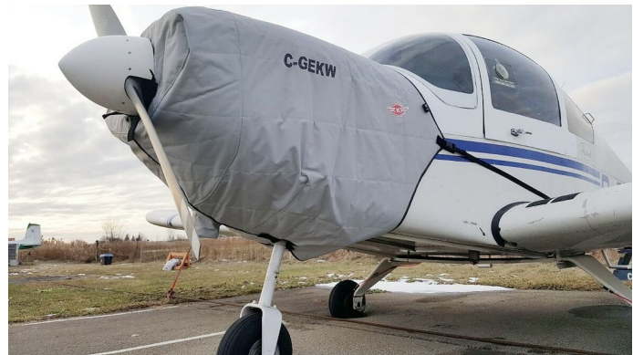
Alarus CH-2000 Insulated Engine Cover