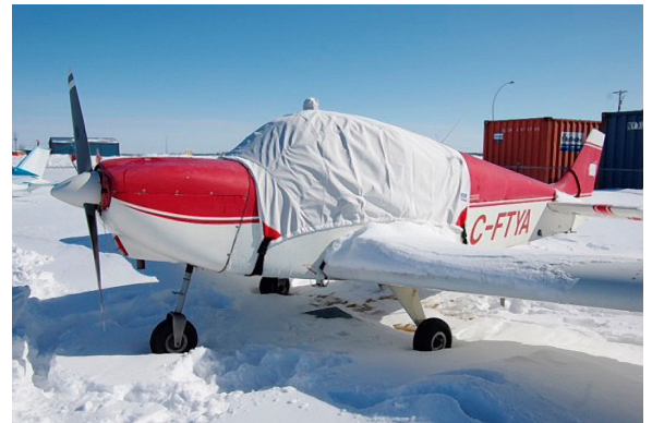
Alarus CH2000 Canopy Cover & Engine Plugs