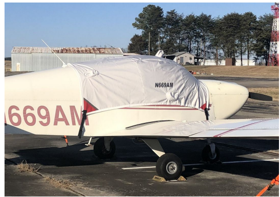
Alarus CH2000 Canopy Cover