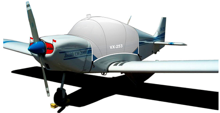
AMD Alarus CH2000 Std Canopy Cover & Engine Plugs (Illustration)