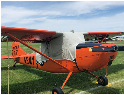
Cessna L-19 Bird Dog Over-Top Canopy Cover