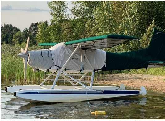
Cessna A185F Complete Cover Set

the hottest of days. It is water, ice and snow repellent, yet breathable to allow moisture to escape from between the cover and the aircraft surface.