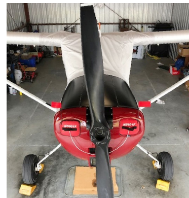
Cessna Bird Dog, L-19, O-1, 305 Engine Inlet Plugs