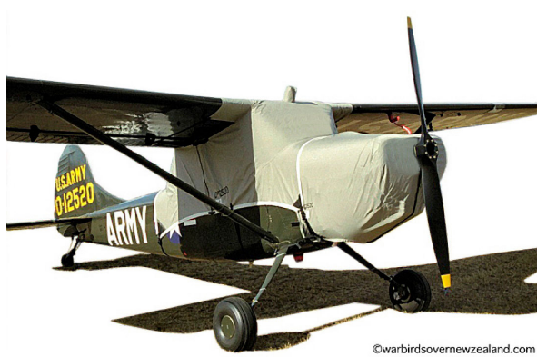
Cessna L-19 Canopy & Engine Covers

the hottest of days. It is water, ice and snow repellent, yet breathable to allow moisture to escape from between the cover and the aircraft surface.