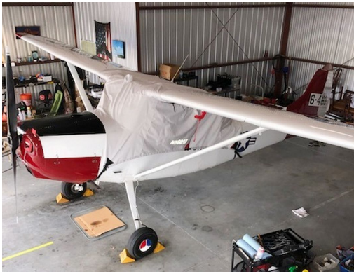
Cessna Bird Dog, L-19, O-1, 305 Canopy Cover, Over-Top Type