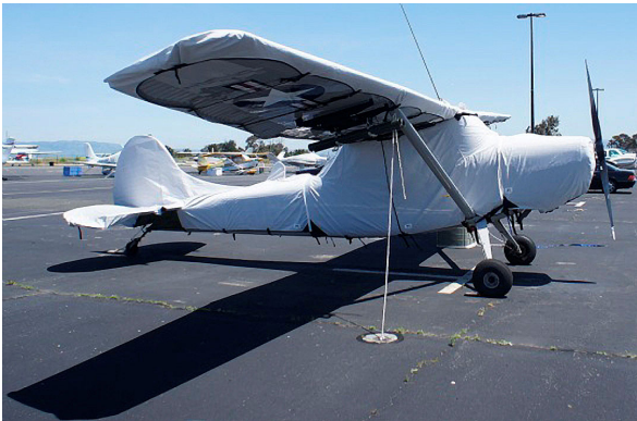
Wing Covers on Cessna Bird Dog