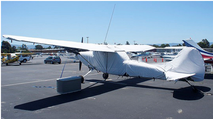
Cessna L-19 Extended Over-the-top Canopy, Engine, Empennage & Wing Covers

WINTER USE MATERIAL - Made with Solution-Dyed Polyester fabric, this option is intended for seasonal use to aid in deicing, rain mitigation, or for occasional travel. The material is lighter and more compact, but more susceptible to UV damage and may have a shorter useful life if used continuously outside than the all-year use material.