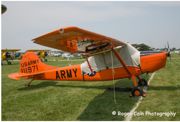
Cessna L19 Bird Dog Canopy Cover