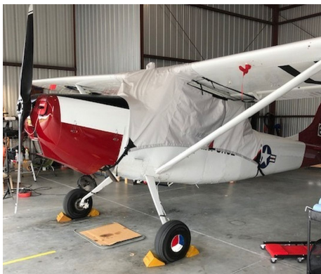
Cessna Bird Dog, L-19, O-1, 305 Canopy Cover, Over-Top Type