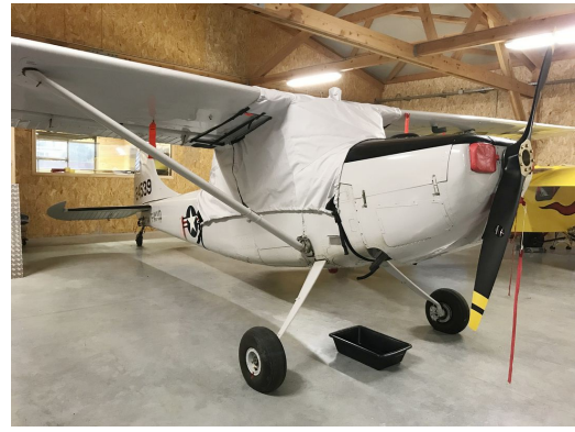
Cessna L-19 Bird Dog Over-Top Canopy Cover