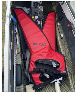
Schempp-Hirth Ventus-2B winglet/wingtip pads

Designed to prevent damage to the wingtip in crowded hangars or high traffic areas, these products are made of bright red Naugahyde and thickly padded with a sandwich of closed cell foam. Protects delicate winglets, casters and their housings, and soft finishes.