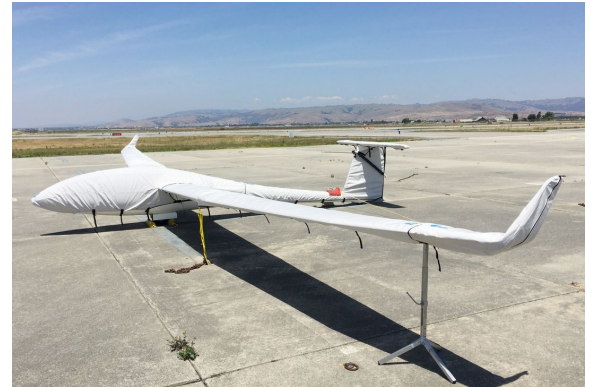
Schempp-Hirth Discus 2B Full Cover Set