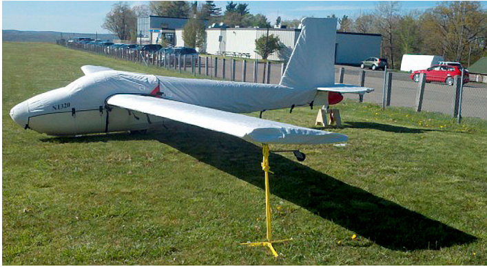
SGS 1-26B Canopy/Nose, Empennage & Wing Covers