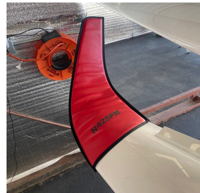
Stemme S-10 & S-12 Wingtip Pads