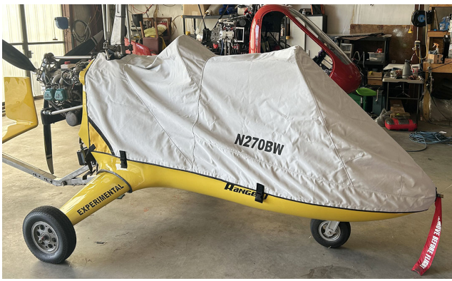
American Ranger AR-1 Gyrocopter Canopy/Nose Cover