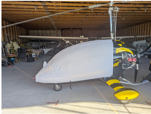
American Ranger AR-1 Gyrocopter Canopy/Nose Cover, enclosed cockpit

Travel Covers are made with Silver Solution-Dyed Polyester fabric and fully lined over the entire cover. The material is lightweight and more compact for easy stowage in the aircraft. The polyester material is water resistant, but only intended for occasional use outside. We also have an ultra lightweight material available for fitted hangar dust covers. For daily outdoor use, the non-travel Sunbrella Cover is the best choice.