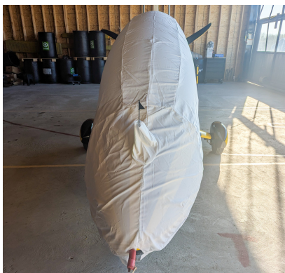
American Ranger AR-1 Gyrocopter Canopy/Nose Cover, enclosed cockpit

Travel Covers are made with Silver Solution-Dyed Polyester fabric and fully lined over the entire cover. The material is lightweight and more compact for easy stowage in the aircraft. The polyester material is water resistant, but only intended for occasional use outside. We also have an ultra lightweight material available for fitted hangar dust covers. For daily outdoor use, the non-travel Sunbrella Cover is the best choice.