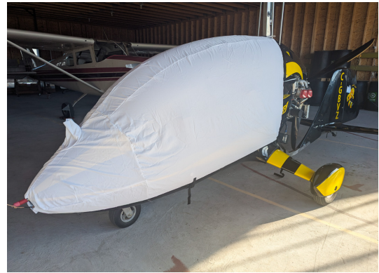
American Ranger AR-1 Gyrocopter Canopy/Nose Cover, enclosed cockpit