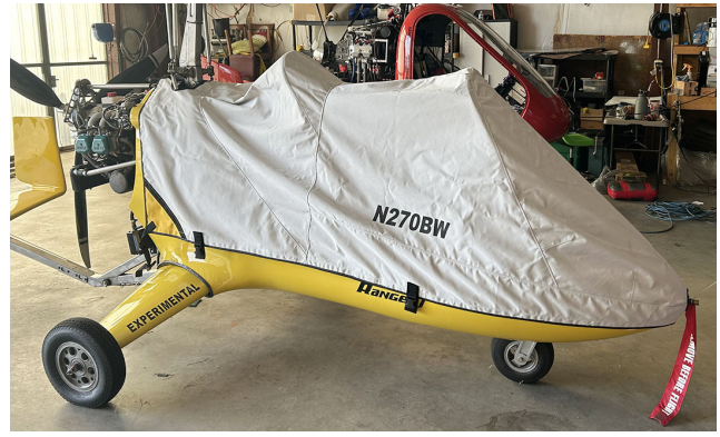
American Ranger AR-1 Gyrocopter Canopy/Nose Cover