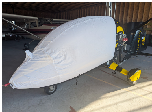
American Ranger AR-1 Gyrocopter Canopy/Nose Cover, enclosed cockpit