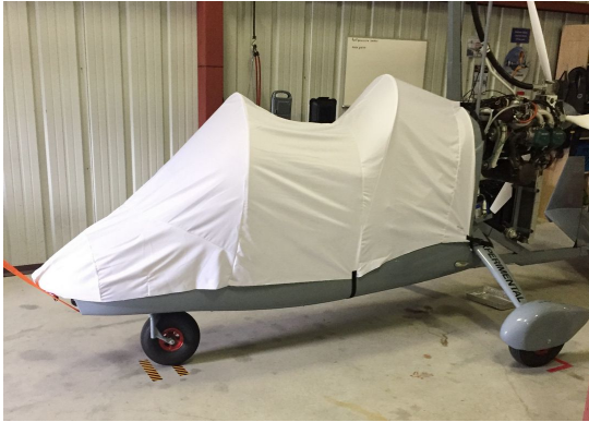
Magni M16 Autogyro Canopy/Nose Cover, test fit cover

Travel Covers are made with Silver Solution-Dyed Polyester fabric and fully lined over the entire cover. The material is lightweight and more compact for easy storage in the aircraft. The polyester material is water resistant, but only intended for occasional use outside. We also have an ultra lightweight material available for fitted hangar dust covers. For daily outdoor use, the non-travel Sunbrella Cover is the best choice.