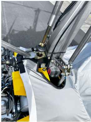
AR1 American Ranger Gyrocopter Travel Cover, Lightweight Canopy/Nose Cover

Travel Covers are made with Silver Solution-Dyed Polyester fabric and fully lined over the entire cover. The material is lightweight and more compact for easy storage in the aircraft. The polyester material is water resistant, but only intended for occasional use outside. We also have an ultra lightweight material available for fitted hangar dust covers. For daily outdoor use, the non-travel Sunbrella Cover is the best choice.