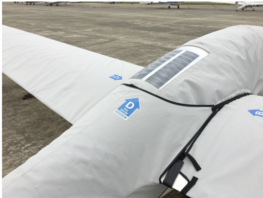
DG-505 Full Cover Set

WINTER USE MATERIAL - Made with Solution-Dyed Polyester fabric, this option is intended for seasonal use to aid in deicing, rain mitigation, or for occasional travel. The material is lighter and more compact, but more susceptible to UV damage and may have a shorter useful life if used continuously outside than the all-year use material.