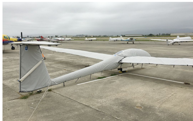
DG-505 Canopy/Nose, Wing, Empennage & Horiz. Stab. Covers DG-505 Canopy/Nose, Wing, Empennage & Horiz. Stab. Covers