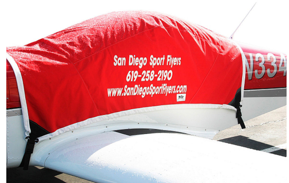
Gobosh Canopy Cover with custom Imprint