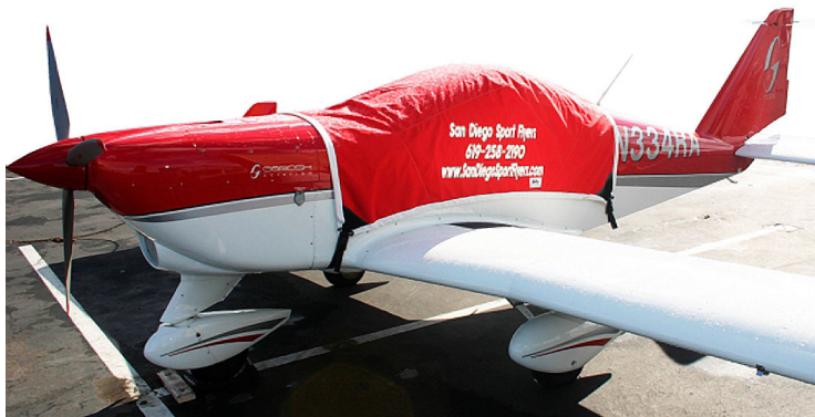
Gobosh Canopy Cover with custom Imprint

This cover type is made from Silver Acrylic Sunbrella canvas and is 100% lined with a soft and smooth microfiber. Bruce's Custom Covers developed this material combination especially for aircraft protection. The outer material is medium weight and treated for water resistance, UV resistance and anti-static buildup. The inner lining is a very soft and smooth microfiber to prevent scratching. The material is very reflective, and tests show that the cabin interior temperature can be reduced to near-ambient temperature on the hottest of days. It is water, ice and snow repellent, yet breathable to allow moisture to escape from between the cover and the aircraft surface.