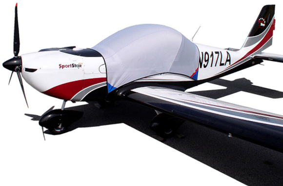
Ekvork Sportstar Light Weight Travel-Cover

This cover type is made from Silver Acrylic Sunbrella canvas and is 100% lined with a soft and smooth microfiber. Bruce's Custom Covers developed this material combination especially for aircraft protection. The outer material is medium weight and treated for water resistance, UV resistance and anti-static buildup. The inner lining is a very soft and smooth microfiber to prevent scratching. The material is very reflective, and tests show that the cabin interior temperature can be reduced to near-ambient temperature on the hottest of days. It is water, ice and snow repellent, yet breathable to allow moisture to escape from between the cover and the aircraft surface.