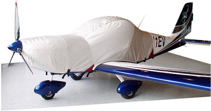
Evektor Sportstar Extended Canopy/Engine Cover