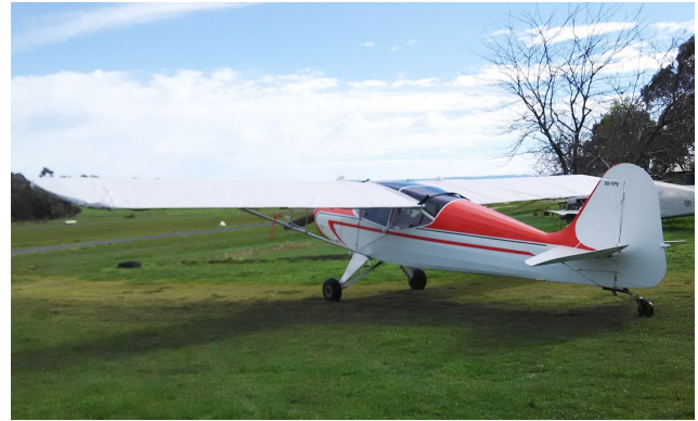
Auster J5 Autocar Wing Covers