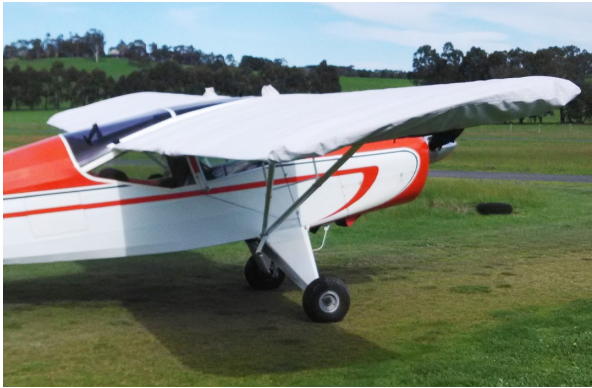
Auster J5 Autocar Wing Covers

WINTER USE MATERIAL - Made with Solution-Dyed Polyester fabric, this option is intended for seasonal use to aid in deicing, rain mitigation, or for occasional travel. The material is lighter and more compact, but more susceptible to UV damage and may have a shorter useful life if used continuously outside than the all-year use material.