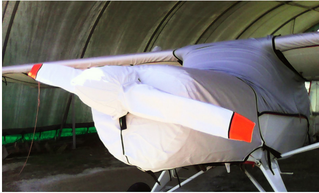
Auster J5 Canopy, Engine, and Propellor Covers