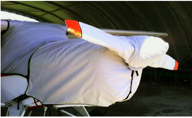
Auster J5 Canopy, Engine, and Propellor Covers