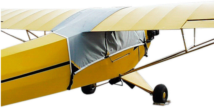
Piper J3 Over-Top Canopy Cover