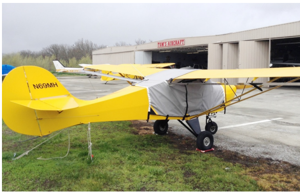
Avid Flyer Extended Canopy Cover