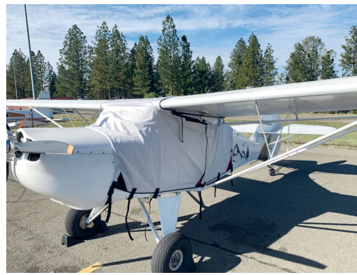
Avid Heavy Hauler MK 4 Over The Top Style Canopy Cover