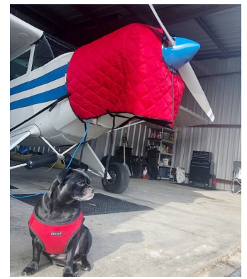
Piper PA-12 Insulated Hangar Blanket