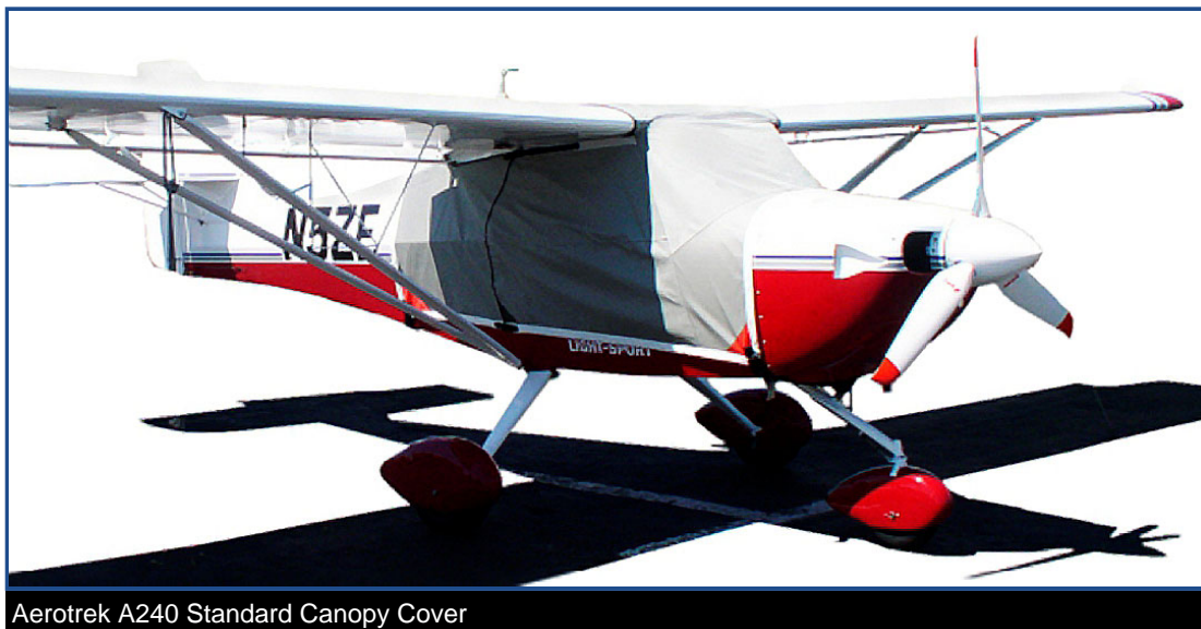
Aerotrek A240 Standard Canopy Cover