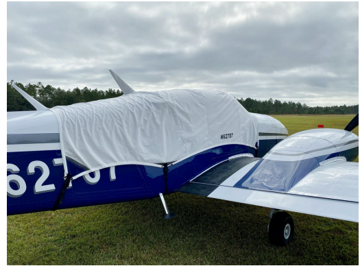
Piper PA-23-250 Aztec Canopy cover