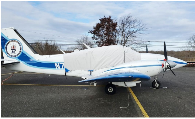
Piper Aztec Canopy Cover, Engine Plugs