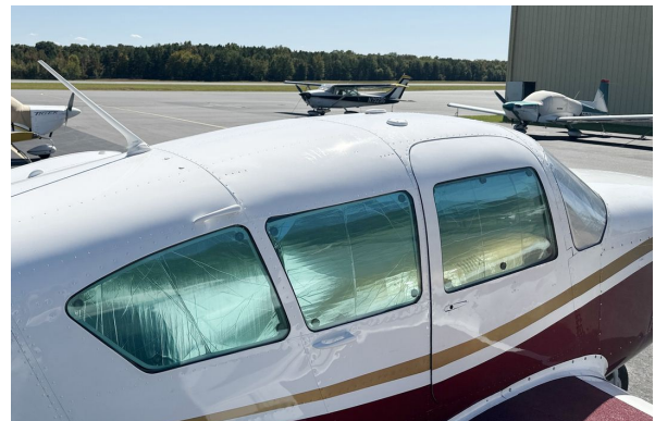
Piper Aztec HeatShields