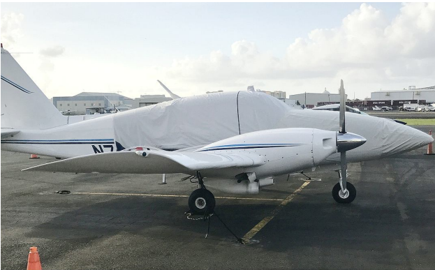
Piper Aztec Canopy/Nose Cover

Travel Covers are made with Silver Solution-Dyed Polyester fabric and only lined over the windshield to save weight. The material is lightweight and more compact for easy stowage in the aircraft. The polyester material is water resistant, but only intended for occasional use outside. We also have an ultra lightweight material available for fitted hangar dust covers. For daily outdoor use, the non-travel Sunbrella Cover is the best choice.