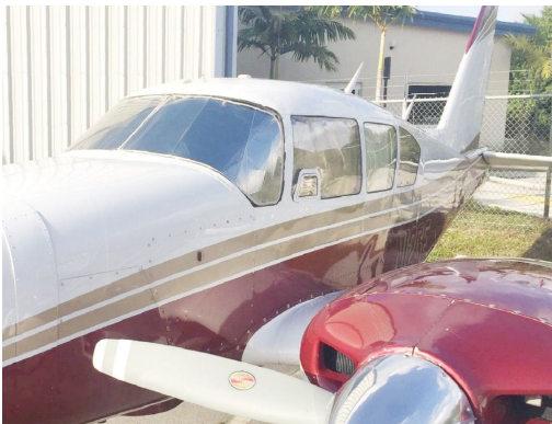
Piper Aztec HeatShield Set

Windshield Heatshields are interior sunshades for an aircraft's front windshield. The product is a unique composite of closed-cell foam with a silver mylar finish. The semi-rigid design is stiff enough to stand along the inside of the windshield using sun visors or window framing. It folds up flat and easily stores in the included storage sleeve. Some designs may require velcro and suction cups or split right and left sides. A Heatshield is an excellent short-term remedy for cockpit overheating. An external fabric cover is far more effective and practical for long-term protection.