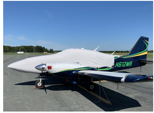
Piper Aztec Canopy Nose Cover