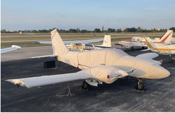
Piper Aztec Complete Cover Set

This cover type is made from Silver Acrylic Sunbrella canvas and is 100% lined with a soft and smooth microfiber. Bruce's Custom Covers developed this material combination especially for aircraft protection. The outer material is medium weight and treated for water resistance, UV resistance and anti-static buildup. The inner lining is a very soft and smooth microfiber to prevent scratching. The material is very reflective, and tests show that the cabin interior temperature can be reduced to near-ambient temperature on the hottest of days. It is water, ice and snow repellent, yet breathable to allow moisture to escape from between the cover and the aircraft surface.