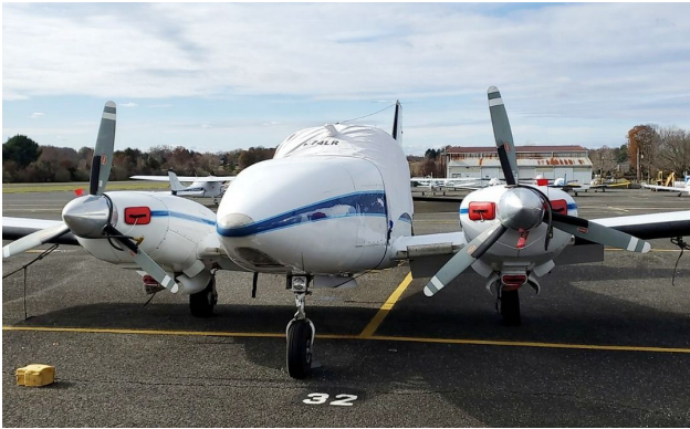
Piper Aztec Canopy Cover, Engine Plugs

are imprinted with the aircraft registration number in black for an extra charge. Storage bag NOT included. Engine plugs may be inserted after flight when the engine is still warm. Engine Inlet Plugs are commonly referred to as Cowl Plugs, Intake Plugs, Cowl Blocks, Engine Blocks, and Engine Bungs.