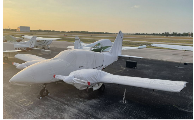
Piper Aztec Complete Cover Set