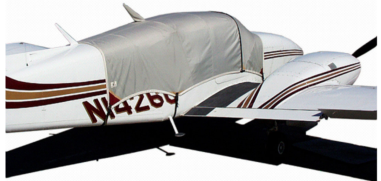
Standard Aztec Canopy Cover