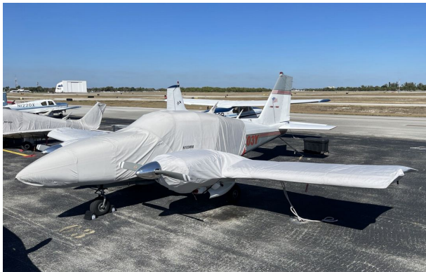
Piper Aztec Extended Canopy/Nose & Wing/Engine Covers

WINTER USE MATERIAL - Made with Solution-Dyed Polyester fabric, this option is intended for seasonal use to aid in deicing, rain mitigation, or for occasional travel. The material is lighter and more compact, but more susceptible to UV damage and may have a shorter useful life if used continuously outside than the all-year use material.