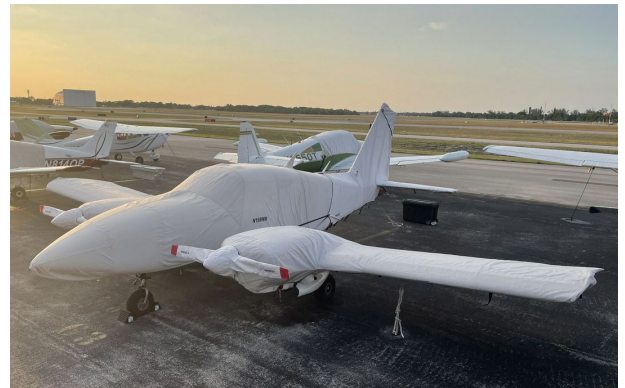
Piper Aztec Complete Cover Set