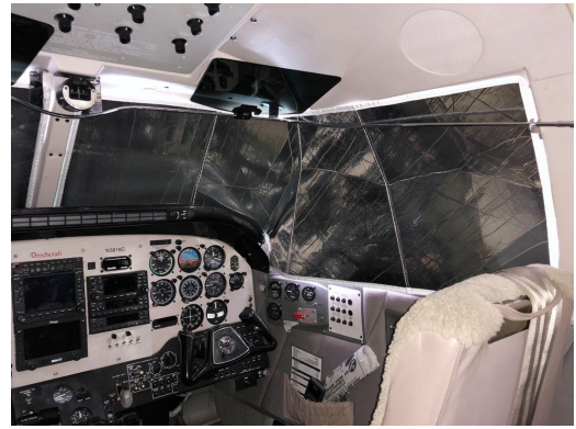
Beech King Air 90 & 100 (U-21, RU-21, T-44) Cockpit Heatshields