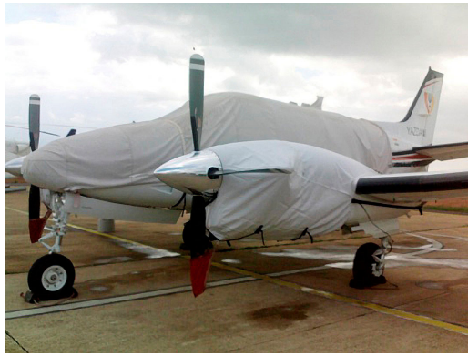
King Air C90 Canopy/Nose Cover, Engine Covers