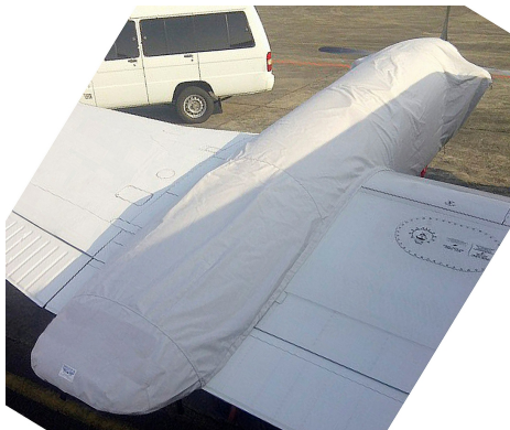
King Air 350 Engine Cover