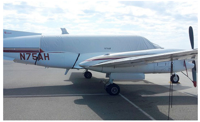
King Air 350 Canopy Cover