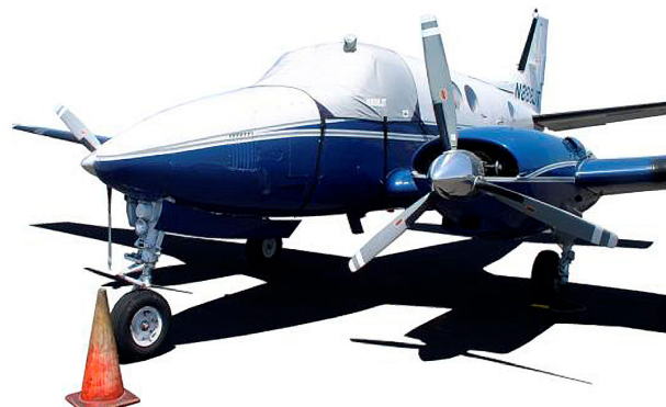
King Air Cockpit Cover, belly-strap type