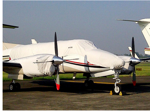
King Air 350 Canopy/Nose Cover, Engine Covers