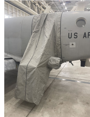
King Air Airstair Door Cover