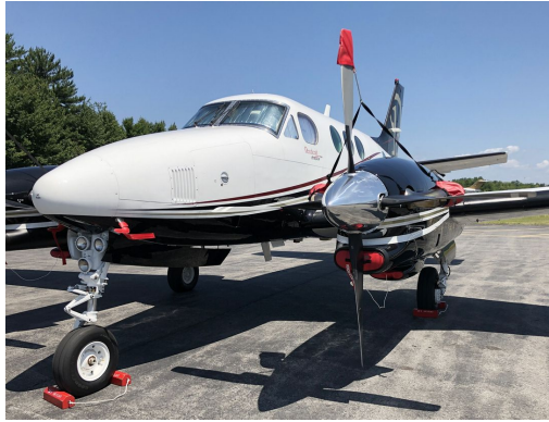
Beech C90A Prop Tie Downs/Exhaust Covers