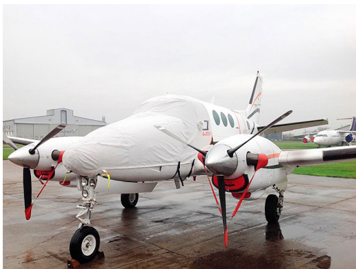
King Air Cockpit/Nose Cover, Plugs, Prop Tie/Exhaust Covers