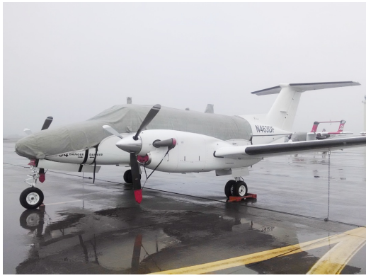
King Air 200 Canopy/Nose Cover, Engine Plugs & Prop Ties