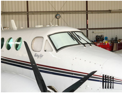
Beech King Air 90 & 100 (U-21, RU-21, T-44) Cockpit Heatshields