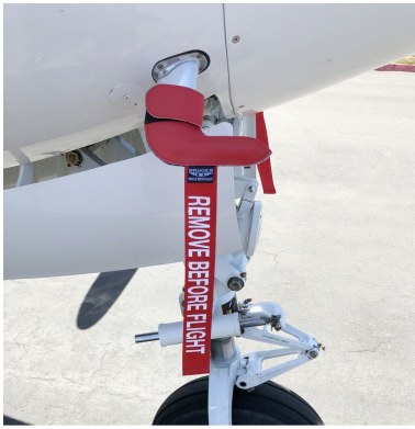
Beech King Air Pitot Covers