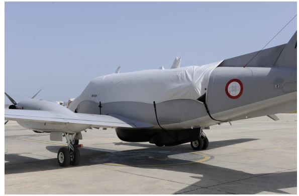
King Air 200 Canopy/Nose Cover