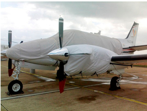
King Air C90 Canopy/Nose Cover, Engine Covers