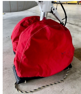
Beech King Air 300 Tire Covers (main gear)