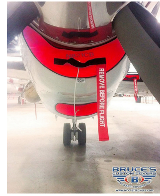
Engine and Oil Cooler Inlet Plugs