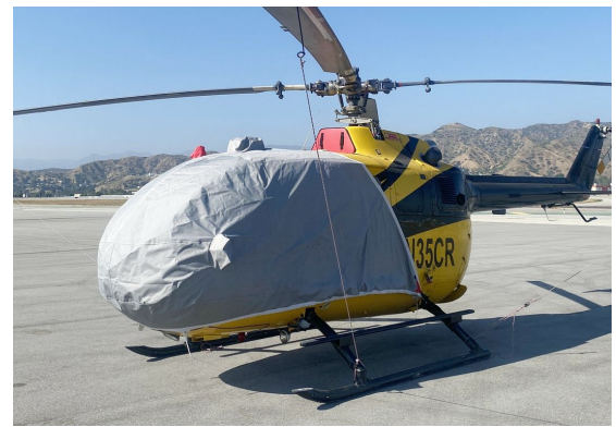
Eurocopter BO-105 Bubble Cover, Standard Model