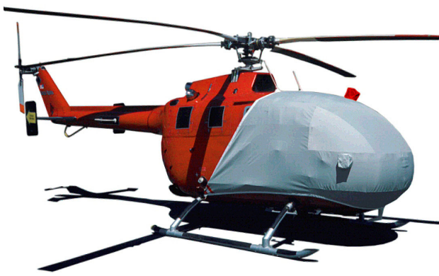
MBB BO-105 Bubble Cover