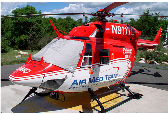
BK-117 Windshield Cover