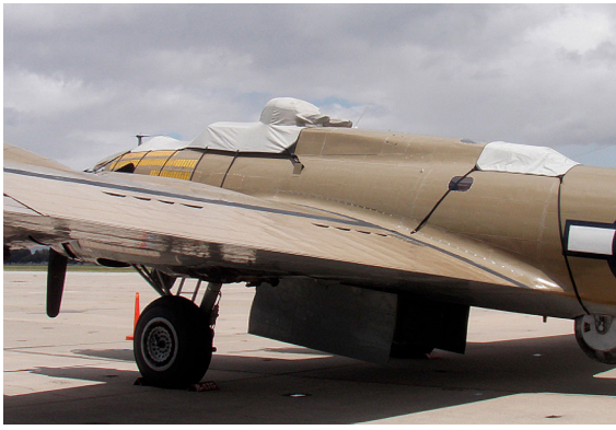
B-17 Canopy/Gun Turret Cover & Hatch Cover