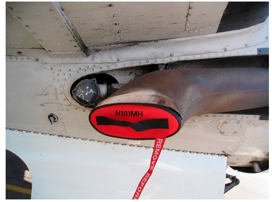
Beech 18 Exhaust Plugs