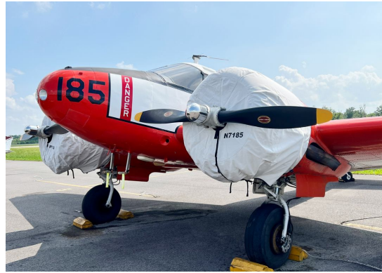
Beech 18 Engine Covers, non-insulated