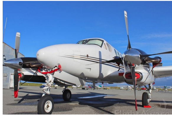
King Air C90A Engine Plugs and Pitot Covers