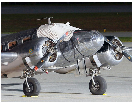
Beech D18S Cockpit Cover

This cover type is made from Silver Acrylic Sunbrella canvas and is 100% lined with a soft and smooth microfiber. Bruce's Custom Covers developed this material combination especially for aircraft protection. The outer material is medium weight and treated for water resistance, UV resistance and anti-static buildup. The inner lining is a very soft and smooth microfiber to prevent scratching. The material is very reflective, and tests show that the cabin interior temperature can be reduced to near-ambient temperature on the hottest of days. It is water, ice and snow repellent, yet breathable to allow moisture to escape from between the cover and the aircraft surface.