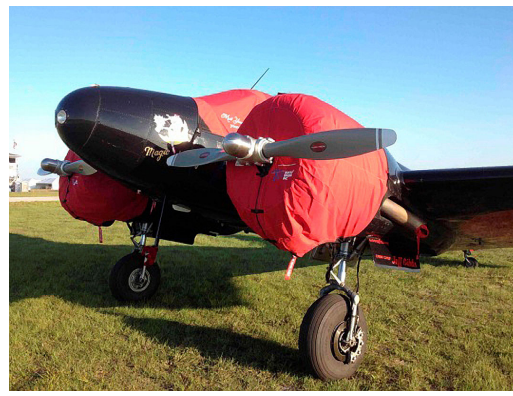
Twin Beech 18 Cockpit & Engine Covers, Younkin Airshow model