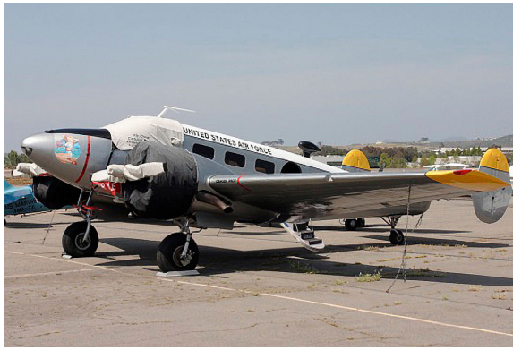
Twin Beech 18 Cockpit, Engine & Prop Covers