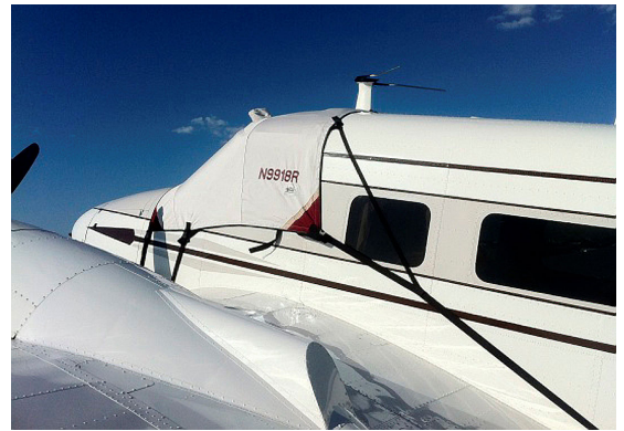
Beech 18 Cockpit Cover