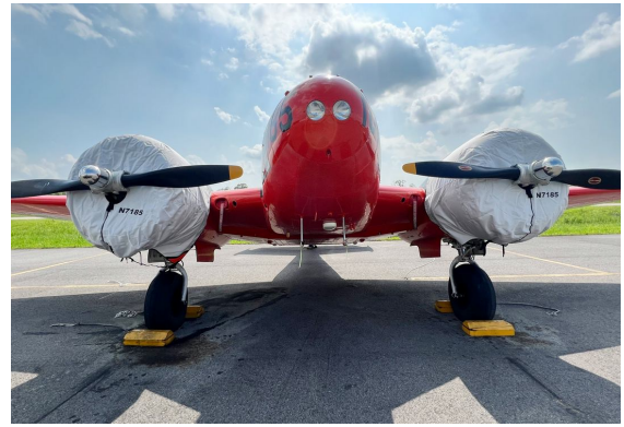
Beech 18 Engine Covers, non-insulated