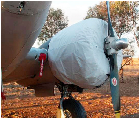
Beech D-18 Engine Covers, Center Section Oil Cooler Inlet Plugs, and Pitot Covers