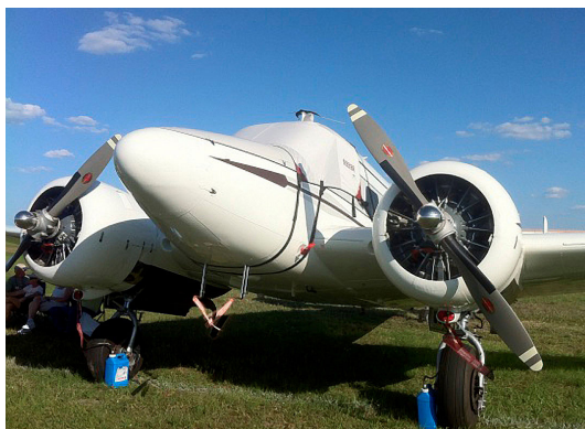
Beech 18 Cockpit Cover & Carb Inlet Plugs

This cover type is made from Silver Acrylic Sunbrella canvas and is 100% lined with a soft and smooth microfiber. Bruce's Custom Covers developed this material combination especially for aircraft protection. The outer material is medium weight and treated for water resistance, UV resistance and anti-static buildup. The inner lining is a very soft and smooth microfiber to prevent scratching. The material is very reflective, and tests show that the cabin interior temperature can be reduced to near-ambient temperature on the hottest of days. It is water, ice and snow repellent, yet breathable to allow moisture to escape from between the cover and the aircraft surface.