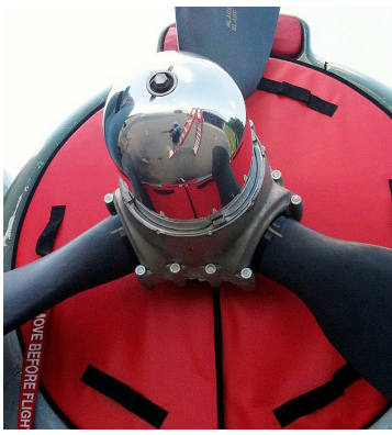
C-46 Radial Engine Intake Plug