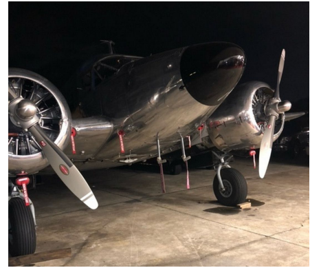
Beech 18 Engine & Oil Cooler Inlet Plugs