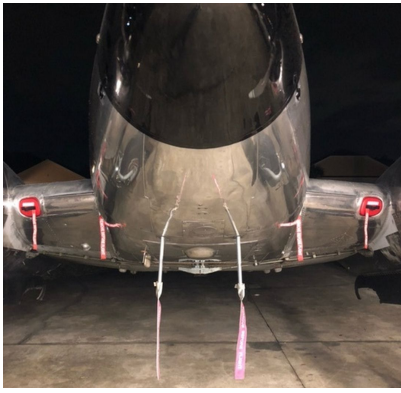
Beech 18 Oil Cooler Inlet Plugs