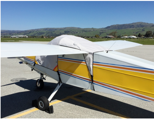
Bolkow Junior 208 Canopy Cover