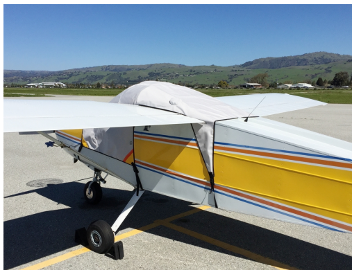
Bolkow Junior 208 Canopy Cover