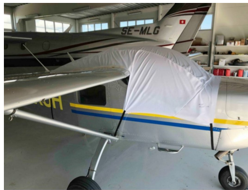
Saab Safari Canopy Cover, test fit cover