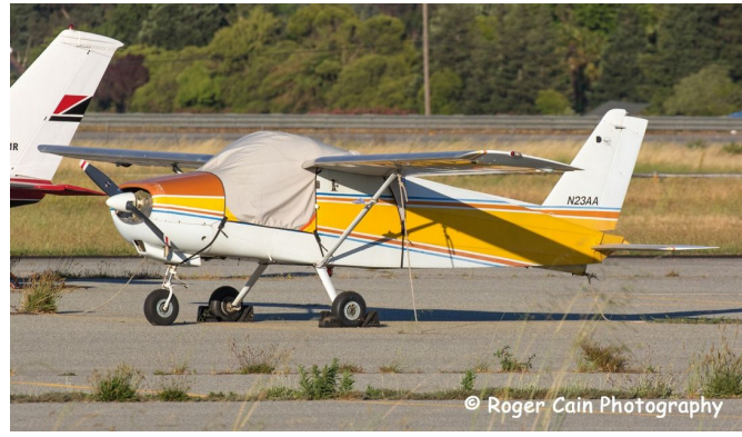
Bolkow Junior 208 Canopy Cover