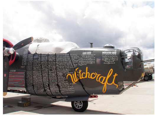
Cockpit/Gun Turret Cover