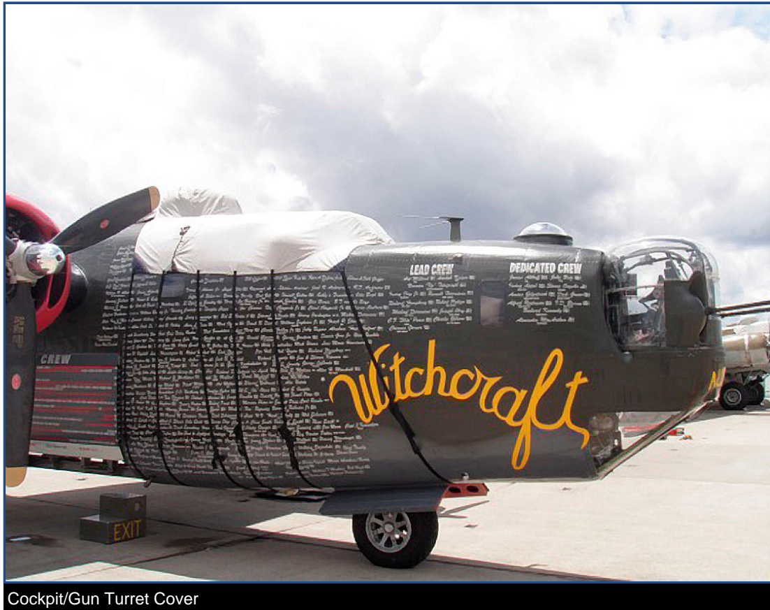
Cockpit/Gun Turret Cover