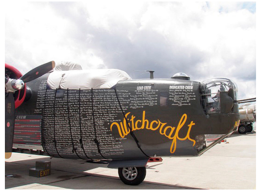
Cockpit/Gun Turret Cover