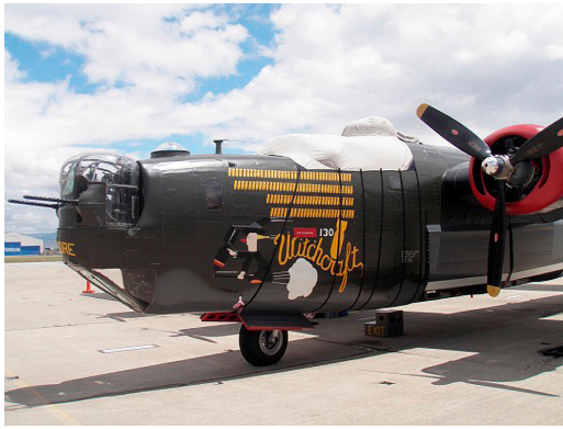
Cockpit/Gun Turret Cover